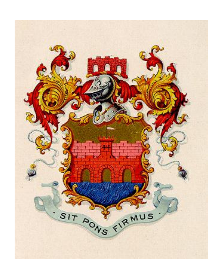
The Trowbridge Family History