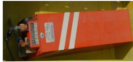
Recovered FDR Module

1.20.4 The data of FDR and CVR was successfully recovered and downloaded at NTSB, USA facility. After downloading the entire data from both the modules, detailed analysis of the CVR and FDR was carried out in USA with the assistance of NTSB investigators. The major focus was to retrieve any information which could assist and help in ascertaining all possible operational and technical aspects along with factors (if any) specifically related to cockpit crew in the aircraft handling after encountering abnormal situation. The FDR contained over 97 hours of flight data whereas CVR module data of 30 minutes audio information was listened and pertinent calls and the conversation amongst the ground crew / technicians, cockpit crew and ATC Controller or the cockpit crew and cabin crew were documented and analysed in detail. The data when correlated with the time and compared with the FDR recorded data helped in re-enacting the entire sequence of events prior to the aircraft ground impact. The vital FDR and CVR data helped the investigation team to ascertain various facts / factors which could have directly or indirectly contributed towards the causation of accident.