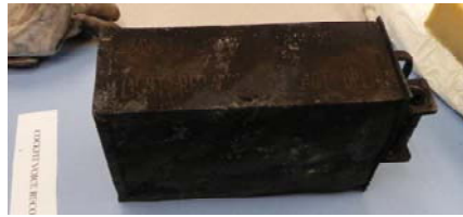
Recovered CVR Module

Underwater Locating Beacon (ULB) battery was overdue for replacement with an inspection date of June, 2010.