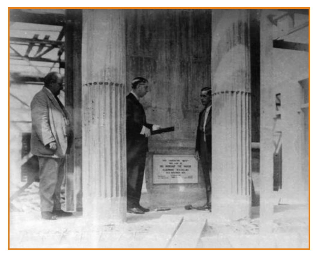
Foundation stone ceremony at the new city council chambers in Cairns, 1929.