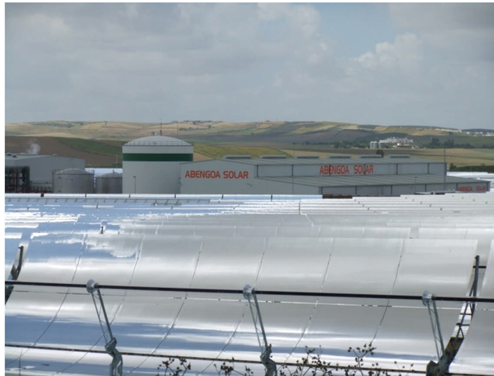
!KaXu Solar One – 100MW trough