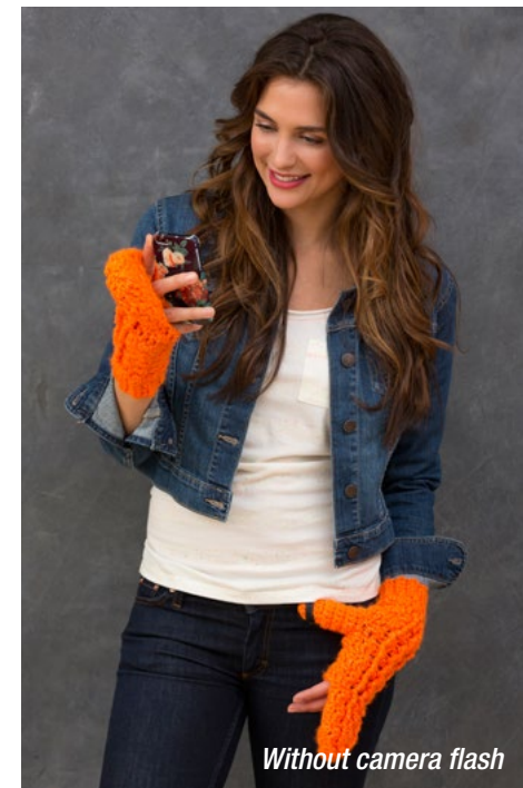
Without camera flash