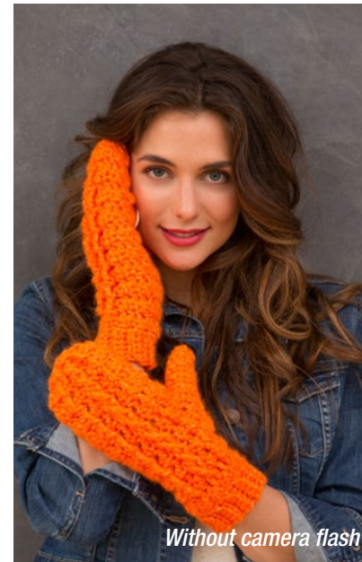
Without camera flash

ch = chain; cm = centimetres; dc = double crochet; mm = millimetres; st(s) = stitch(es); tog = together; tr = triple or treble crochet; trtr = triple treble crochet; [ ] = work directions in brackets the number of times specified; * or ** = repeat whatever follows the * or ** as indicated.