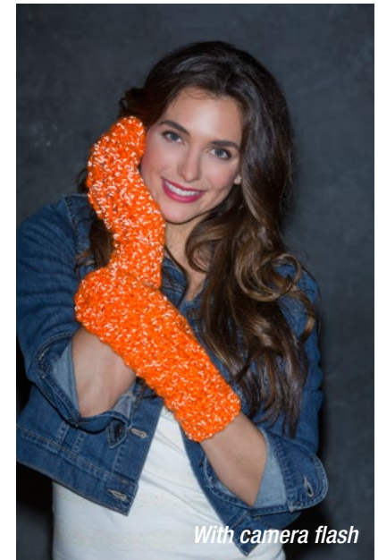
With camera flash