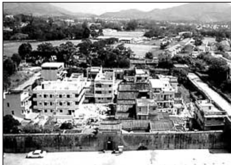
Figure 7: Small House Development Impinging on Heritage Village