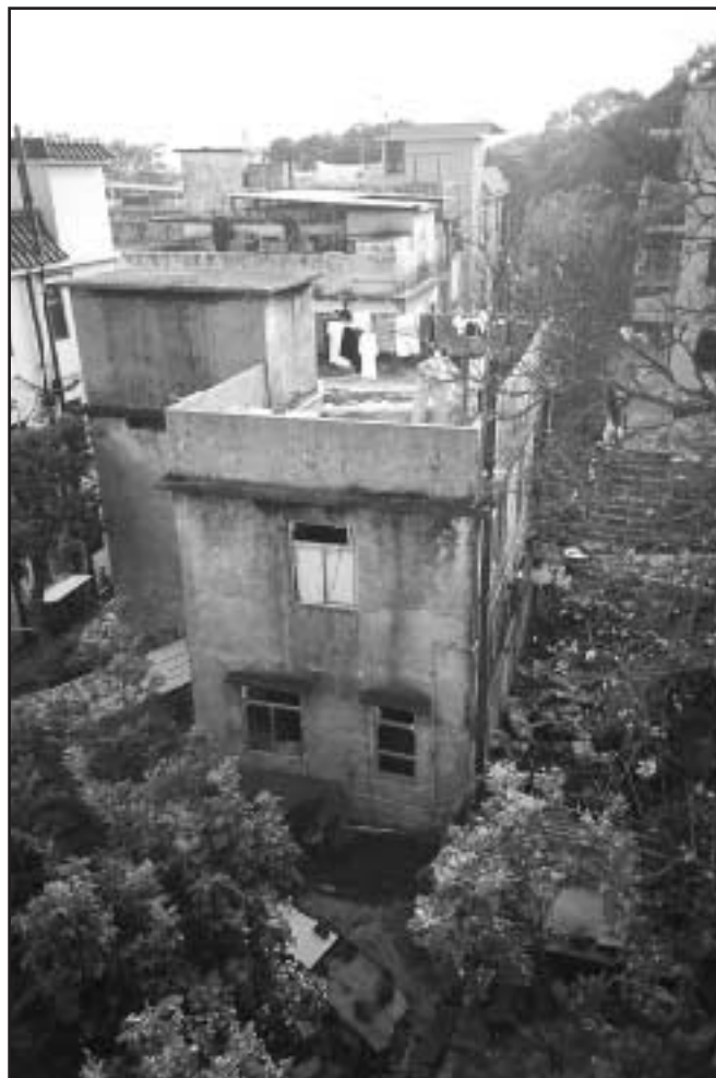
Figure 6: Illegal Small House Built on Government Land

An investigation by the South China Morning Post found a six storey "small" house built on Government land in Yuen Long. A subsequent survey found that one third of 200 houses at Lam Hau Tsuen occupied Government land. 75 However, according to the LandsD there has been only one instance of a small house built illegally entirely on Government land (in San Tin, Yuen Long). 76 There are no figures on how many houses have been built illegally partly on government land, though this is thought to be not uncommon.