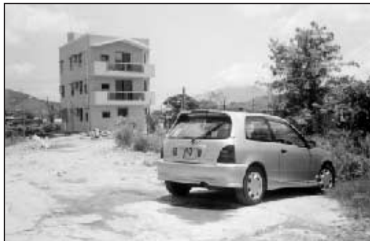
Figure 5: Typical Village Without Layout Plan