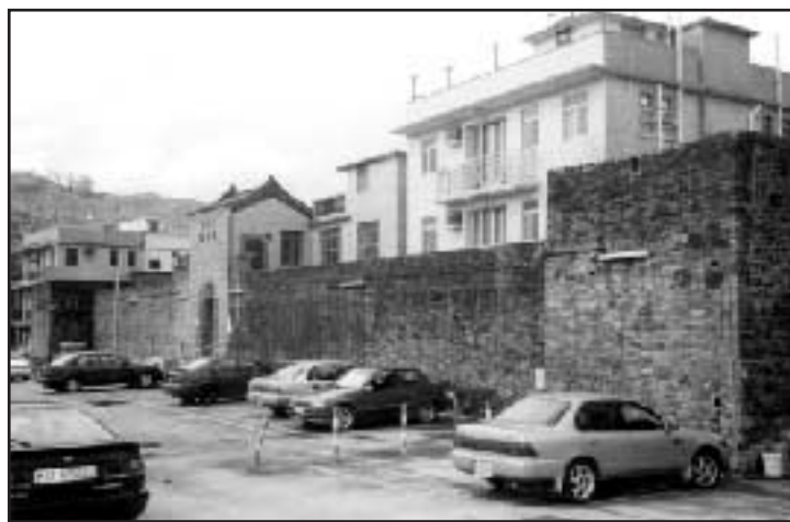
Figure 4: Typical Village With Layout Plan

However, outside the new towns only a few new village layout plans have been drawn up. Basic provisions such as car parking, access roads and proper sewerage and drainage are thus not always provided. The difference between a village with a detailed layout plan and one without is shown in Figures 4 & 5.