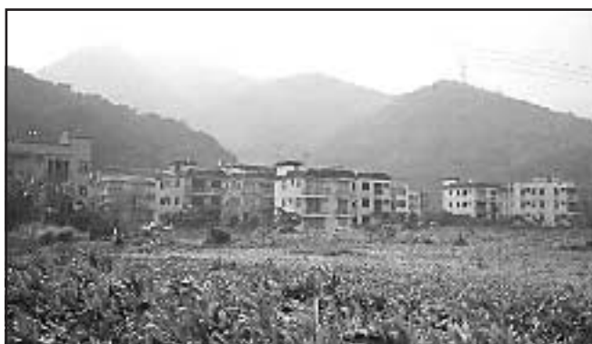
Figure 2: Small House Development Adjacent to Wetland

The area of land left for future small houses has been estimated as 1,781 ha, equal to roughly 71,250 houses. 58 Based on the number of small houses projected for the period 1995-2005 in Yuen Long alone of 18,080, equal to 452 ha, 59 this would mean the zoned V land available would be fully developed by small houses within the next 10-20 years. However, assuming a lower density of houses and/or a much higher projected demand for small houses would mean the V land would be used up much more quickly. 60 In practice not all of the V zone is developable for small houses (less than 40%), the V zones are unevenly distributed, and there is an imbalance between supply of suitable land and demand for small houses.