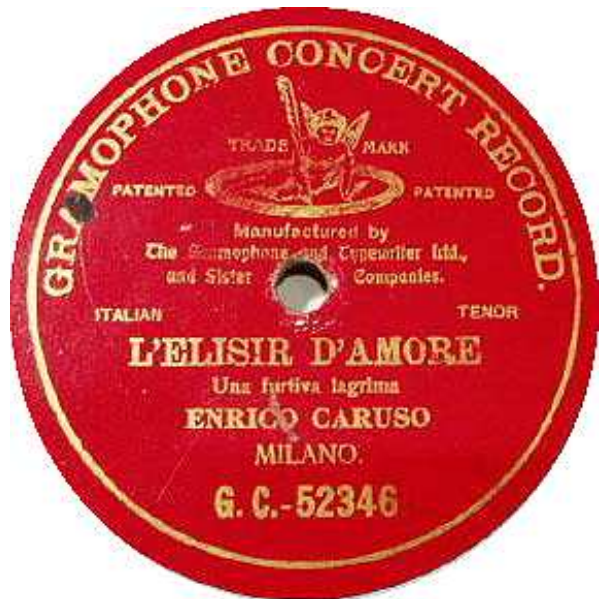
Changed layout. Later issue?