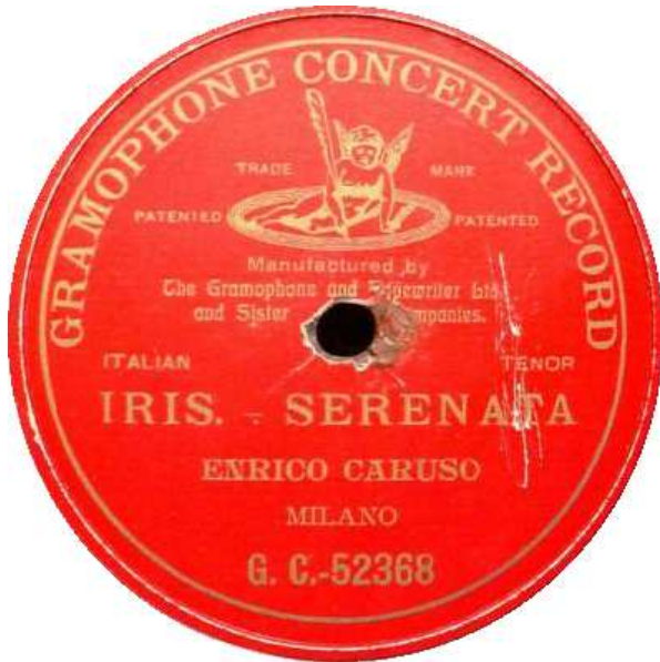
G&T G.C.-52368 - early press