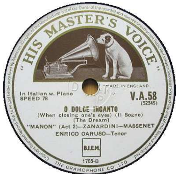
HMV VA 58