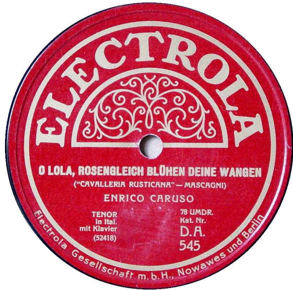
GMR G.C.-52418 - Electrola DA 545 (GER)