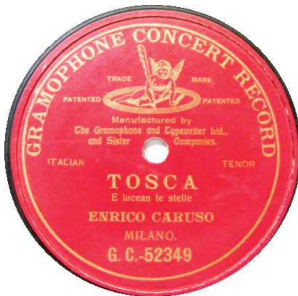
G&T G. C. - 52349