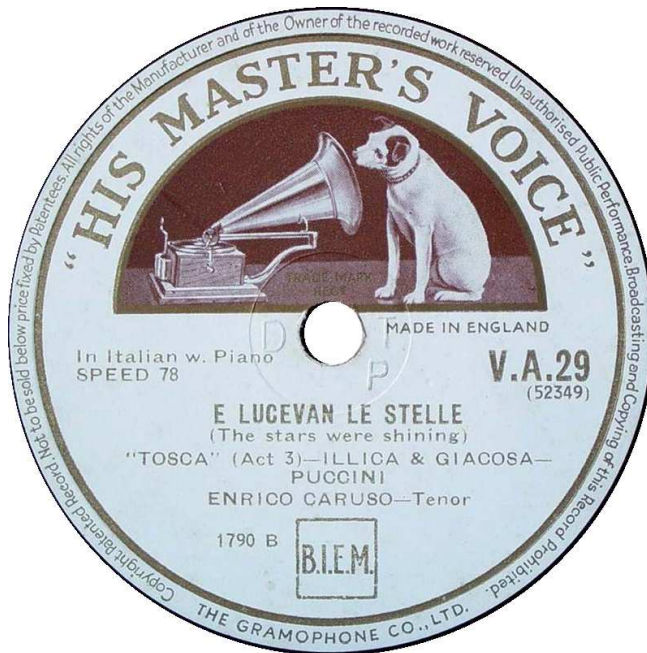
HMV VA 29

1791 Apri la tua finestra - Iris - Mascagni ES (Matrix 1791) CO Stamper IIIII (not V but IIIII) G&T G.C.-52368