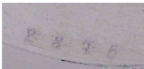
2875-2/vv - 2875 CO