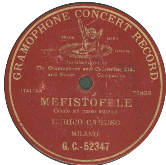
G&T G.C.-52347 - w/"sunk" label - Stamper IIII with CO