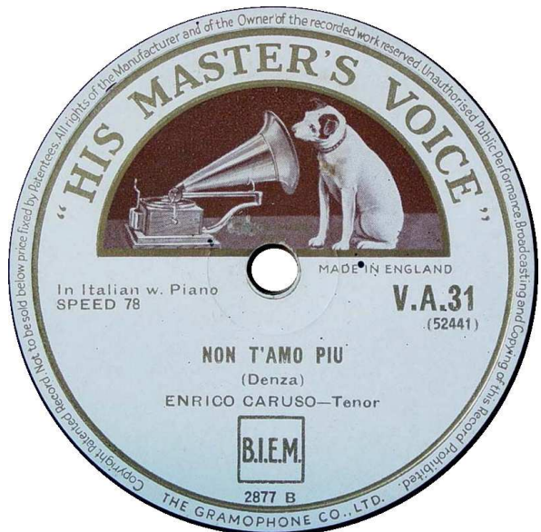
HMV VA 31