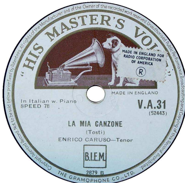
HMV VA 31