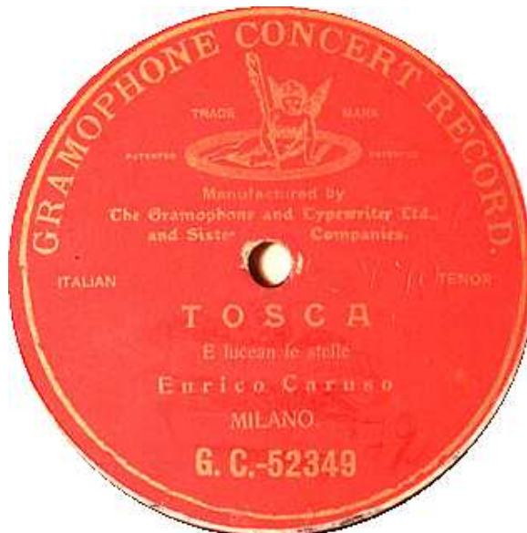
and a later? pressing with small letters in the name