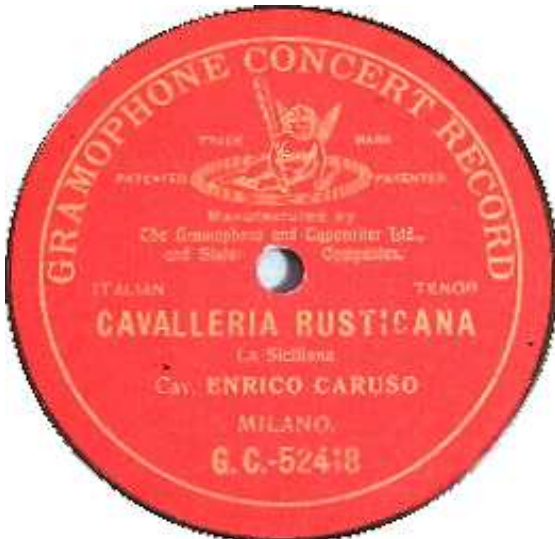
Red G&T G.C.-52418

2876 Siciliana - Cavalleria Rusticana - Mascagni ES (matrix 2876b) Stamper VI G&T G.C.-52418 b/Brindisi - Cavalleria Rusticana HMV DA 545 b/Brindisi - Cavalleria Rusticana Electrola DA 545 ES Victor Monarch 5012 ES Victor 91011 b/Vesti la giubba - Pagliacci - G&T HMV VA 30