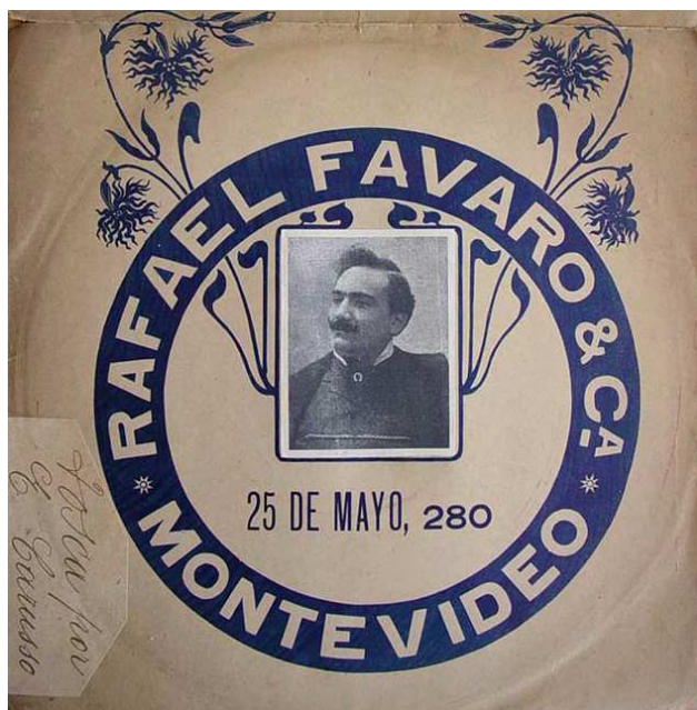
and w/special cover for the South American marked