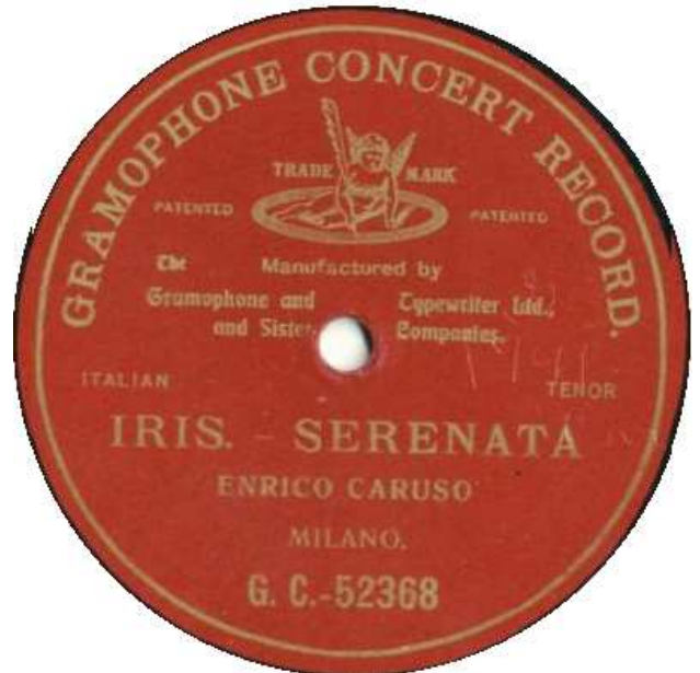
G&T G.C.-52368 Strange layout for THE Gramophone...