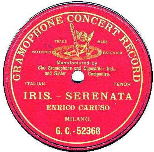
G&T G.C.-52368 - Stamer 7