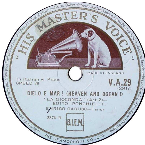
HMV VA 29