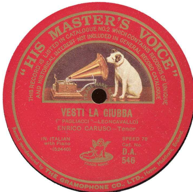
HMV DA 546 Historiske reissues