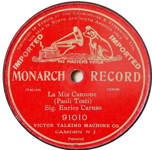
Red G&T G.C.-52443 - Victor Monarch Record 91010 - USA