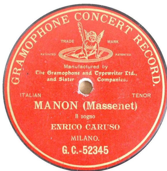
Red G&T G.C.-52345