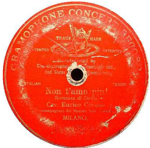
Red G&T G.C.-52441 - and flush label