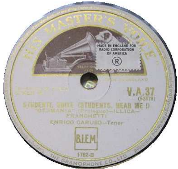
G&T G.C.-52378 - flush label - HMV VA 37 - export label Carusos first recording

1783 Questa o quella - Rigoletto - Verdi ES G&T G.C.-52344