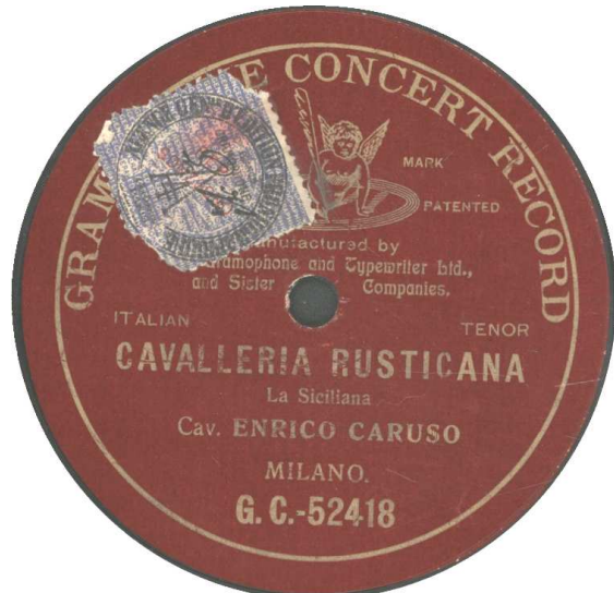
Red G&T G.C.-52418 - Stamper VI