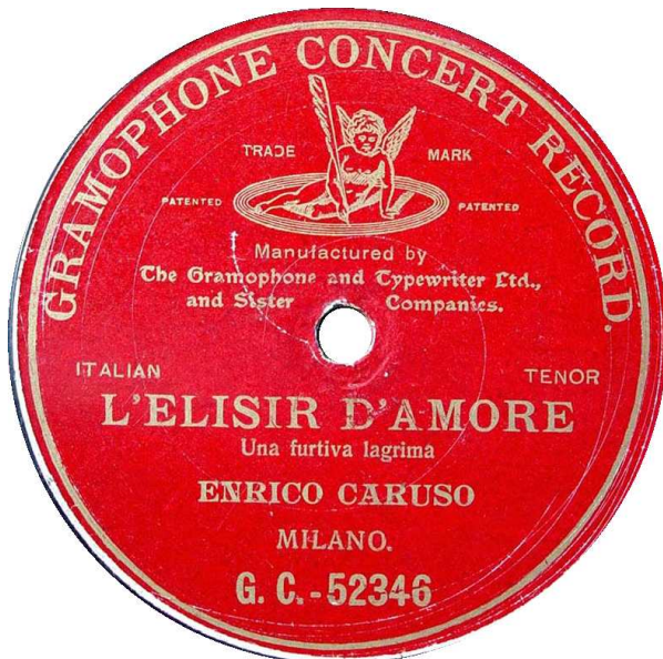
Red G&T G.C.-52346