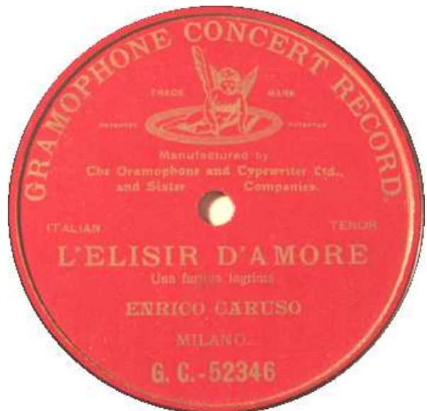
G&T G.C.-52346 Sunk label