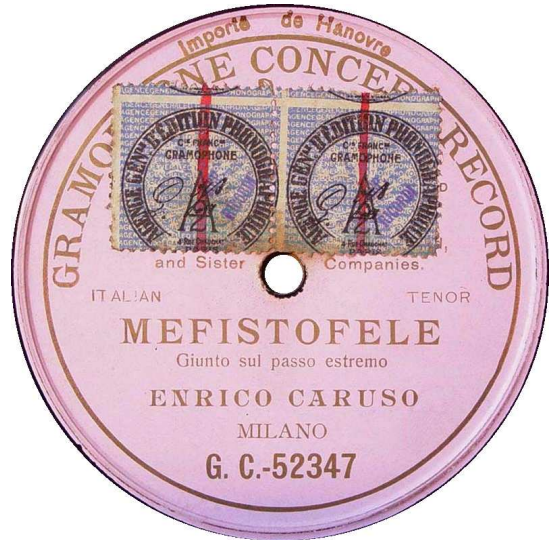
G&T G.C.-52347 - GCR G.C.-52347 - Pre-dog export for South America