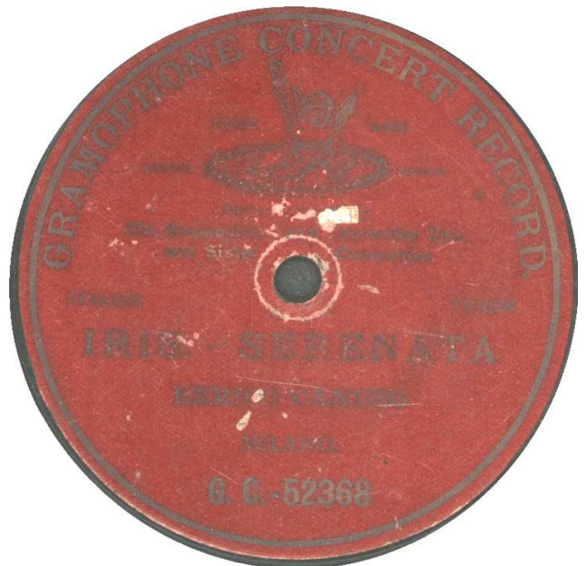
Stamper IIIII CO