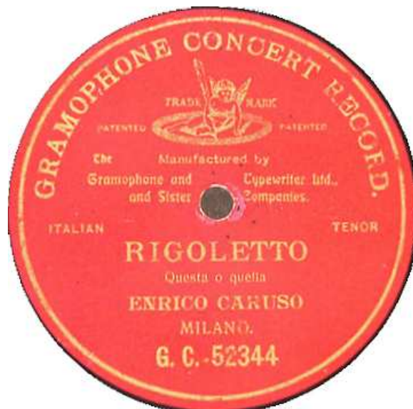
Red G&T G.C.-52344

1783 Questa o quella - Rigoletto - Verdi ES G&T G.C.-52344