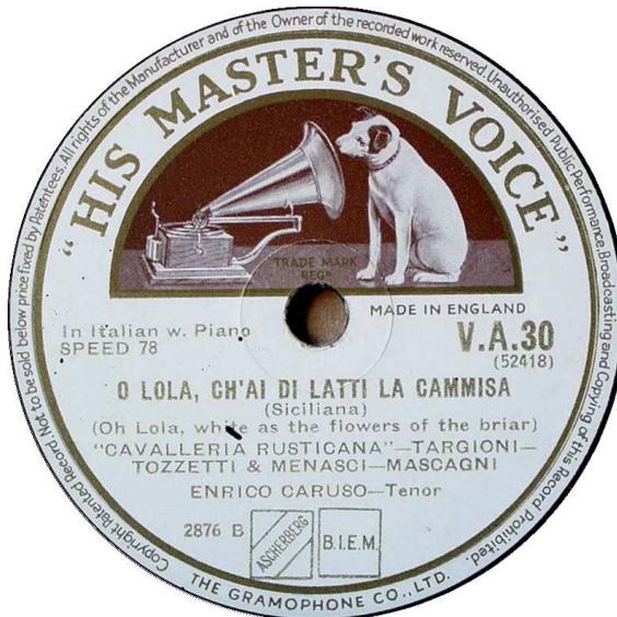
HMV VA 30