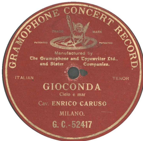
Red G&T G.C.-52417 - changed layout (his name) - matrix 2874-R