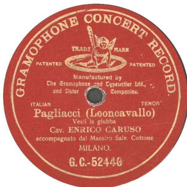
Stamper III and VI G&T 52440 Red G&T - and changed layout (name in Capital letters)