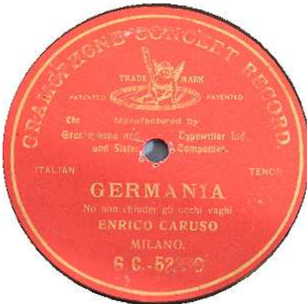
Red G&T G.C.-52370