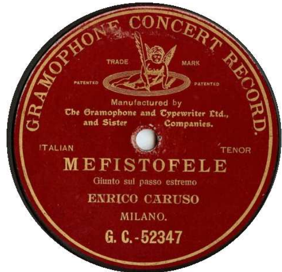
G&T G.C.-52347 - Left: Early press with "flush" label