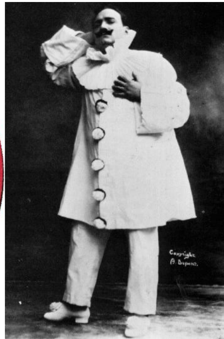
Caruso as Canio in Pagliacci