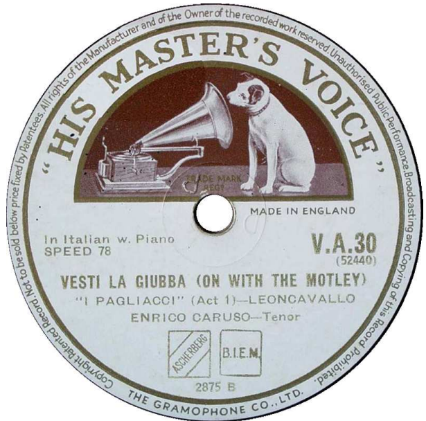
Pirate of Vesti la giubba. Pan American Record 19103 - HMV VA 30

2876 Siciliana - Cavalleria Rusticana - Mascagni ES (matrix 2876b) Stamper VI G&T G.C.-52418 b/Brindisi - Cavalleria Rusticana HMV DA 545 b/Brindisi - Cavalleria Rusticana Electrola DA 545 ES Victor Monarch 5012 ES Victor 91011 b/Vesti la giubba - Pagliacci - G&T HMV VA 30