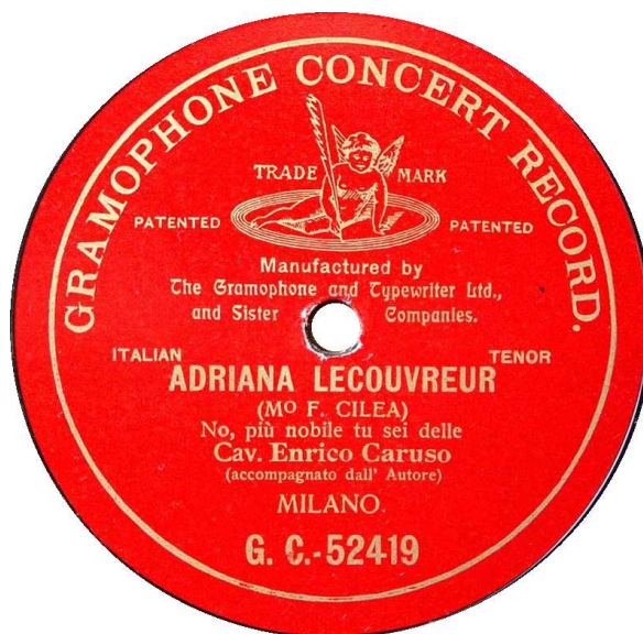
Red G&T G.C.-52419 - changed layout the composer at the piano