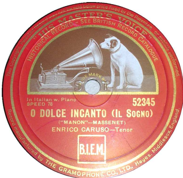
HMV Historical Recordings 52345