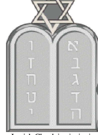
Jewish Chaplains insignia

On April 9, 1917, representatives from seven major Jewish organizations met in New York City to develop and implement a unified national approach to service and support for our Jewish military personnel and Jewish Chaplains.