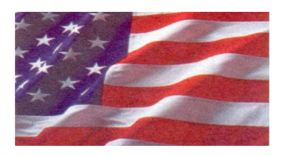
May GOD Bless America!