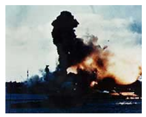
Attack on Pearl Harbor, Dec. 7, 1941

The Japanese attack on Pearl Harbor was an unexpected wake up call for America that galvanized our country into action. We had more