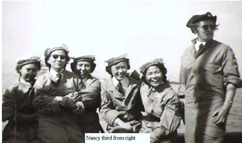
The Wrens relaxing at sea

This was one determined and confident young sailor girl, and it was not long before she started collecting trophies in the form of silver cups, Medals and silver spoons to mark her success.