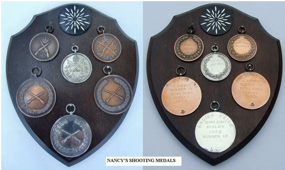
NANCY'S SHOOTING MEDALS