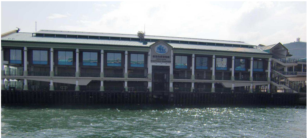
The Hong Kong Maritime Museum, Pier Eight on the Hong Kong Waterfront.