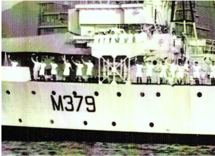
The Wrens can clearly be seen on the upper deck just above the figure 9 of the ships number.