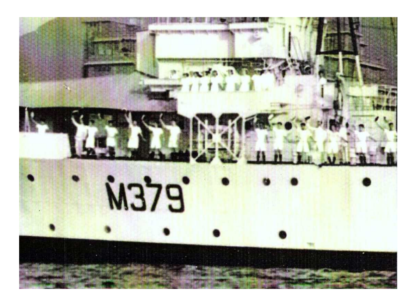
The Wrens can clearly be seen on the <u>upper deck</u> just above the figure 9 of the ships number.