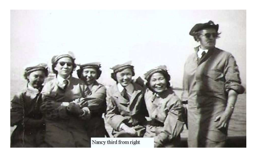
The Wrens relaxing at sea

This was one determined and confident young sailor girl, and it was not long before she started collecting trophies in the form of silver cups, Medals and silver spoons to mark her success.