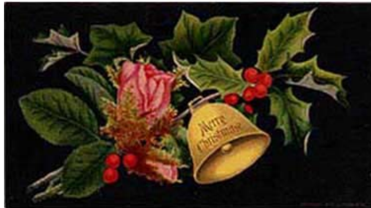
Louis Prang Card - 1876

By the 1850s, greeting cards had become much less expensive because of advances in printing as well as the introduction of the penny stamp in 1840 in England. Germany followed suit and soon greeting cards were being sent by the thousands and thousands all over Europe and beyond.