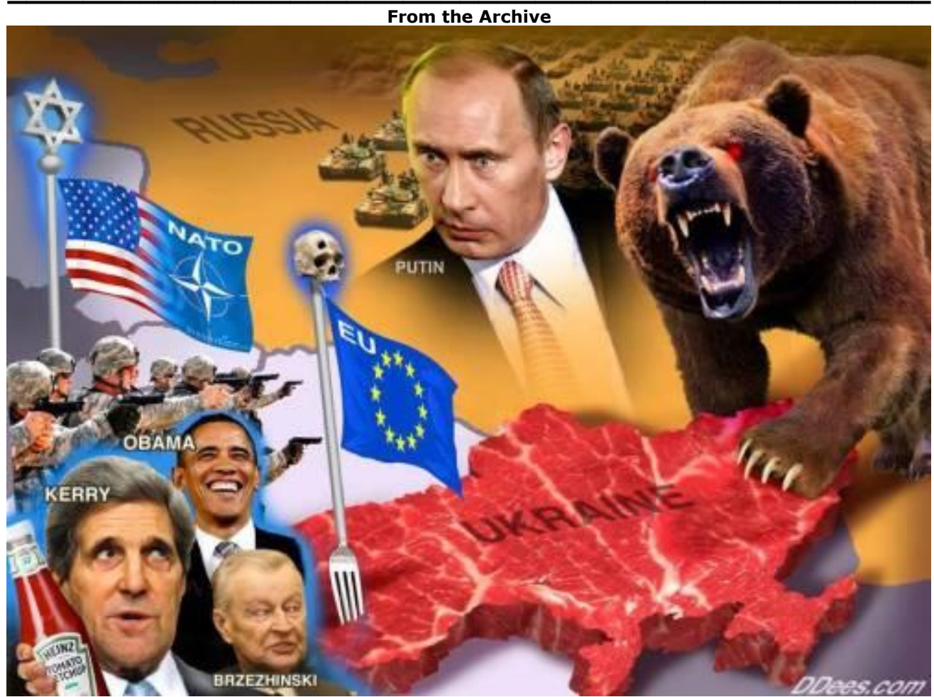
Ex CIA Offizier: Das sind die wahren Schuldigen am Ukraine Krieg (21.9.14) http://www.youtube.com/watch?v=juw4E40_XeI