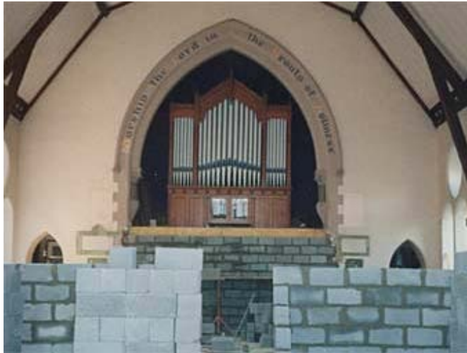
Gradually, the organ was bricked in...