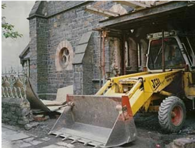
← An opening large enough for a JCB machine was created in the front wall of the building. →