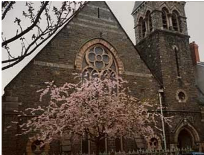
This photograph of the Church was taken in 1986, shortly before renovation work began.