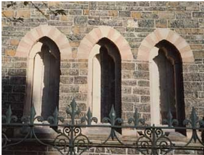
← These windows had to be removed in order to create an entrance for building machinery and equipment. →