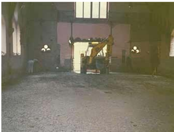
After the pews had been removed, the big machines moved in to excavate the ground floor.