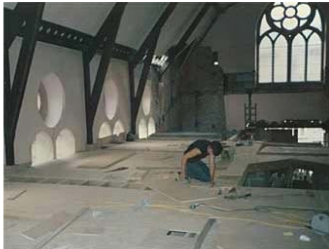
◀ A new floor was created at the top of the building. ▶

1 2 3 4 5 6 7 8 9 10 11 12 13 14 15 16 17 18 19 20