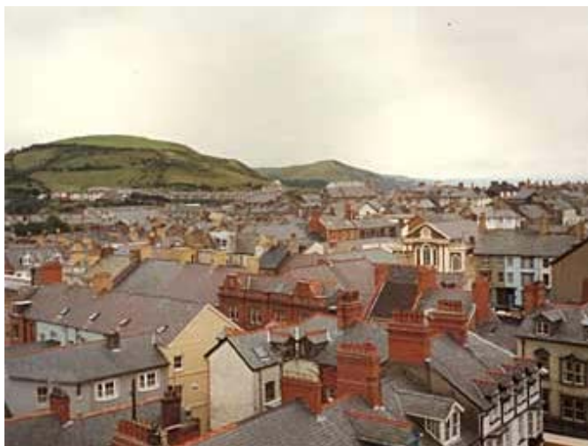
The view from the top of the Church.