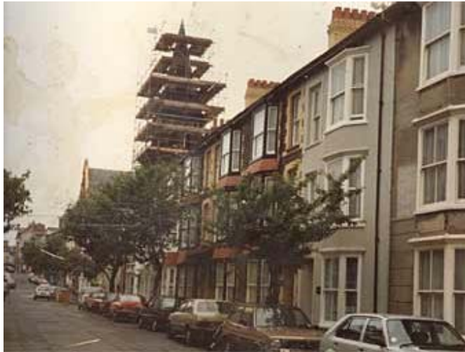
← Scaffolding was erected around the original spire. →