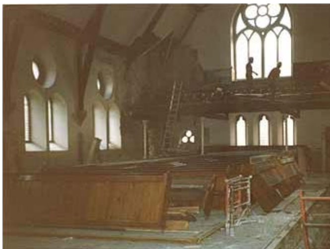
The original pews also had to be cleared.