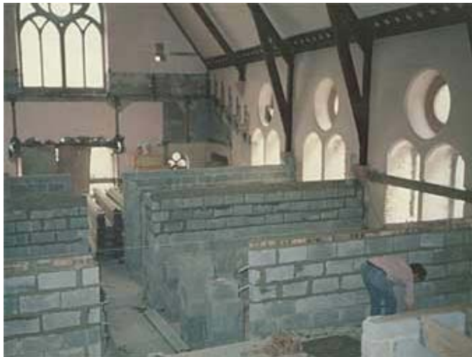
Internal walls were built to create consulting rooms and other areas for the new doctors' surgery.