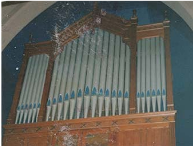
It was on this organ that Dr. Joseph Parry composed the hymn tune 'Aberystwyth'.