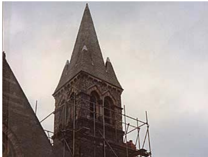
← The original Church spire had to be taken down. →

1 2 3 4 5 6 7 8 9 10 11 12 13 14 15 16 17 18 19 20