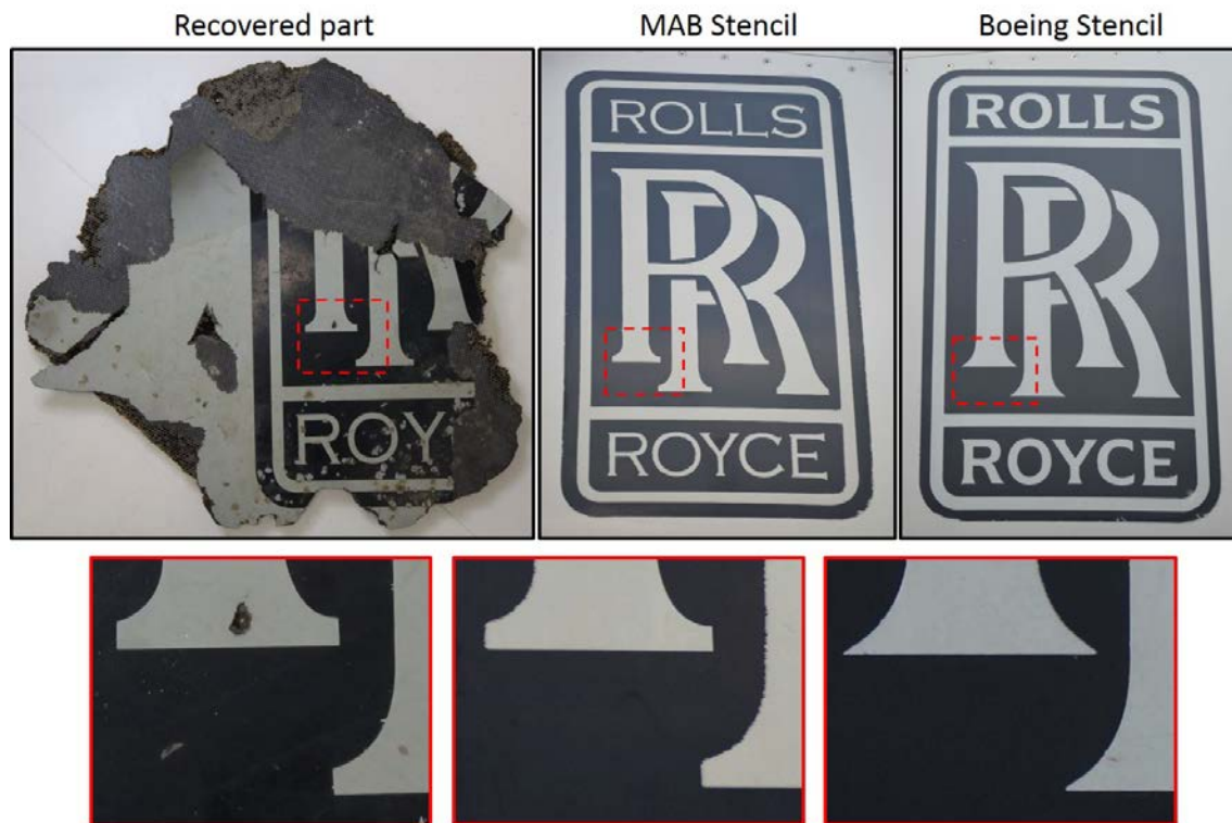
Figure 1: Comparison of Boeing 777 engine cowling stencils

Note the thickness of the “ROYCE” lettering and the serif geometry on the main ‘R’s (enlarged for ease of comparison).