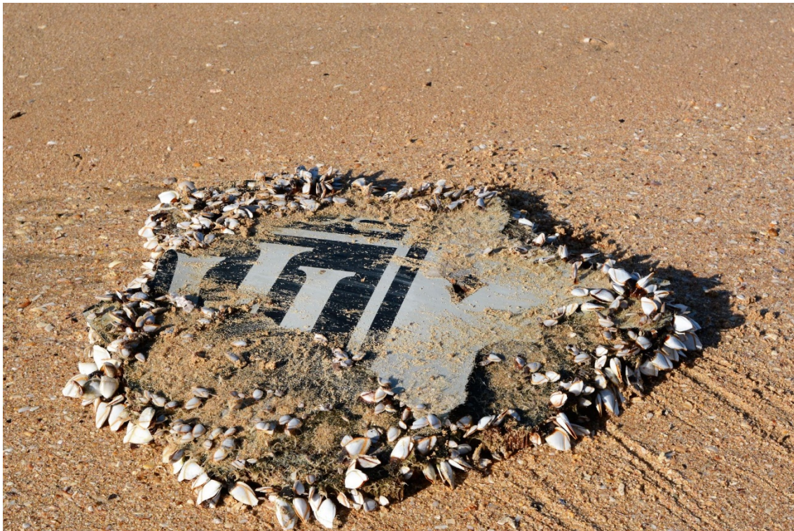
Figure 3: Photograph taken 23 Dec 2015 showing Part No. 3 significantly colonised by barnacles