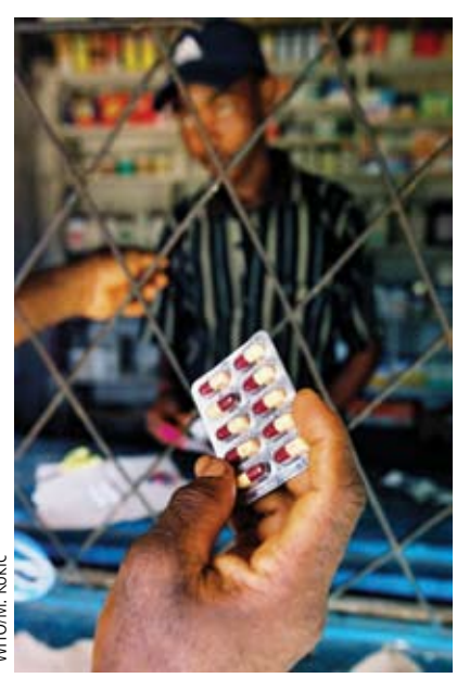
Unlicensed medicines on sale in the Democratic Republic of the Congo

Yet by 2004, a repeat of that survey found that the quantity of unregistered drugs had fallen by 80%. Dr Akunyili describes NAFDAC's success in an article in the Global corruption report . The agency first had to root out corrupt inspectors in its own