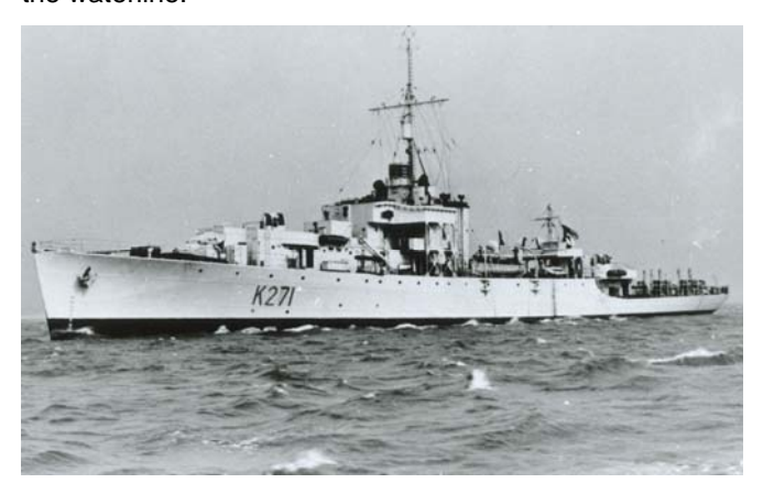
HMS Plym in which the Operation HURRICANE nuclear device was detonated

The most significant vessel of the operation, however, was the frigate HMS Plym. Plym departed the UK, escorting Campania , in June with the atomic bomb embarked. She was moored in the lagoon off Main Beach, Trimouille Island, on 8 August with the bomb fixed below the waterline.