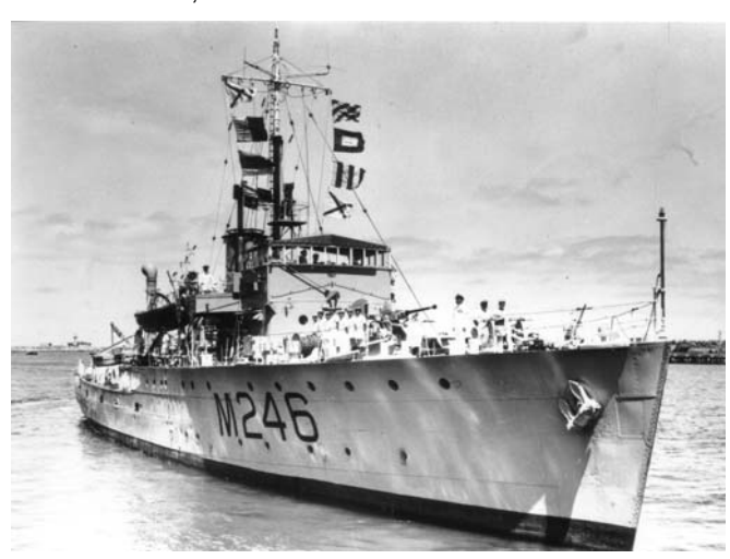
HMAS Fremantle (I) embarked VIPs and members of the press gallery to observe the first Operation MOSAIC detonation

At 1145 all the hands mustered on the port side of the boat deck and the count down commenced at 1148... At 1151, although we had our backs to Trimouille Island, we experienced a blinding flash of intense magnitude, followed by a slight burning feeling across the back of the neck and at the back of the knees. This was only momentarily (sic) and the intensity of the heat resembled the warmth of the sun on a December day. At 'H' plus 5 seconds, the hands were permitted to face the direction of Trimouille Island. On looking round we observed the last stages of the fireball. It resembled a huge oil fuel fire. As soon as it had contracted a thick mass of dark grey cloud rose in a vertical direction at a terrific speed. The familiar mushroom cloud soon developed. Shortly afterwards at approximately H plus 60 seconds, the blast wave was felt.5