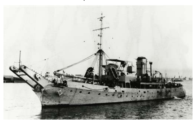
The boom defence vessel HMAS Karangi supported Operations HURRICANE and MOSAIC

The success of the HURRICANE test led to discussions between the British and Australian governments regarding further nuclear testing at Maralinga and Emu Field in South Australia. However, in May 1955 the British government sought an agreement for an additional series of tests at the Montebellos which, it claimed, would reduce the overall weapons development program by six months. This additional series of tests would consist of two separate detonations conducted Operation MOSAIC. The intention on this occasion was to detonate the devices from shore-based towers in an attempt to limit the amount of fallout.