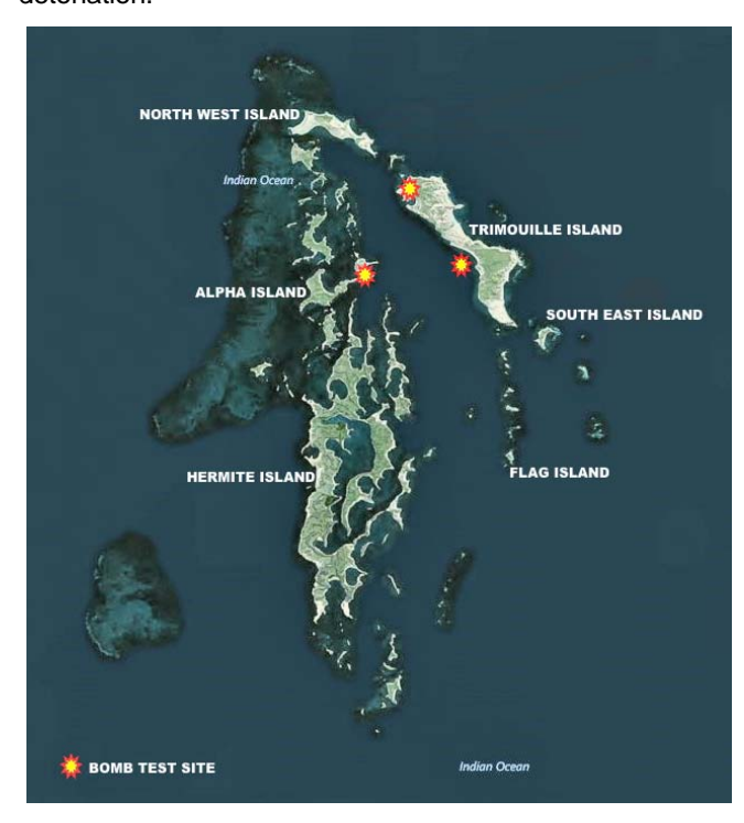
The Montebello Islands depicting the three nuclear test sites from Operations HURRICANE and MOSAIC

As had occurred with HURRICANE, access to contaminated areas was strictly controlled from health control stations established ashore. The withdrawal of TF308 commenced immediately after the second detonation on 19 June. Back loading of stores and equipment was completed by 25 June and all RN units had departed Australian waters by the following day at which time control of access to the islands reverted to the Naval Officer-in-Charge West Australian Area. Fremantle, Karangi, MRL 252 and MWL 251 departed for Fremantle on 27 June. Junee had departed the area after the first detonation.<sup>7</sup>