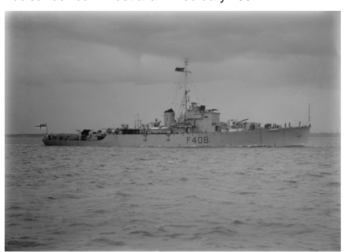
HMAS Culgoa acted as the weather ship for the first British nuclear test, Operation HURRICANE

HMAS Karangi had already made a preliminary survey of the islands in November 1950 and HMAS Warrego (II) conducted a more detailed survey in July and August 1951. Karangi and HMAS Koala laid moorings and placed navigational aids in the area in early 1952 in anticipation of the arrival of the RN/RAN fleet, designated Task Force 4 (TF4), assembled to conduct the test. The Australian government announced the intention to test a British nuclear device in Australia in February 1952.