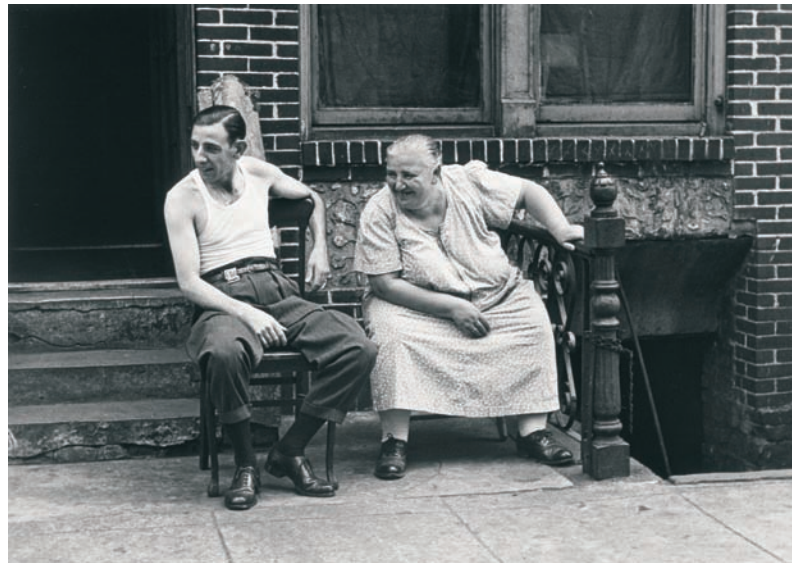
Untitled New York, c. 1942