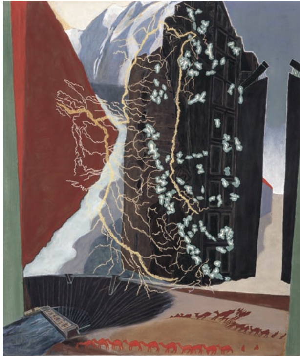
Testament of the Powers That Be (Where Trees Turn to Sand, Residual Colours Stain the Lands) 83cm x 153cm, 2001

Although the immediate answer was no, she wasn't inclined to take that for an answer for long. Within a few years Baer had penetrated the men's club environment of the art world, her fresh new art garnering respect and attention. What becomes a legend most? This award from the Women's Caucus for Art is a most fitting and becoming tribute to one of the great American painters of our age.