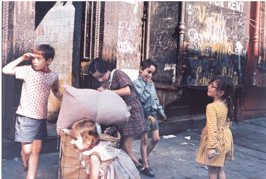
Untitled New York, c. 1972

Often the children and adults of her photographs are so full of themselves that they remain oblivious, or at least indifferent, to Levitt's presence. Yet in some shots, an individual looks penetratingly back to her, perhaps in defiance, or simply with curiosity. Whether they return her gaze or remain isolated from it, her subjects' self-possession, not hers, rules the scene. We usually think of psychic energy as elusive, yet so many of her compositions seem to depend on it. They thrive under its power – it becomes a directional force linking people to each other, and sometimes to her too through the person aware that she has just witnessed the scene.