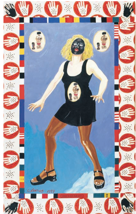
Does Black Rub Off? Oil on linen, 90" h x 56" w, 1999 Collection, the Morris Museum of Art, Augusta, GA

Her works are in many collections including the Museum of Modern Art, the Wadsworth Athenaeum, the Studio Museum in Harlem, the Library of Congress, and the Birmingham Museum of Art. Her awards include an honorary degree from the College of Wooster, grants from the NEA and the New York Foundation for the Arts, a Rockefeller Bellagio fellowship, and the Brandywine 2002 James Van Der Zee Award for Lifetime Achievement.