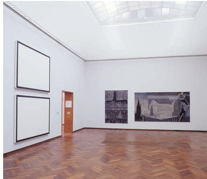
Installation views, Stedelijk Museum 1999

Since 1984, she has lived and worked in Amsterdam. Baer continues to develop the formal content of her paintings in a quasi-figurative manner that she considers radical figuration – without pre-eminence of image or space.