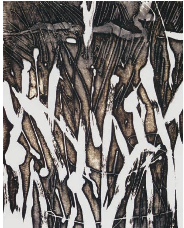
Mujo Deeply etched etching with relief roll 22" x 30", 1974