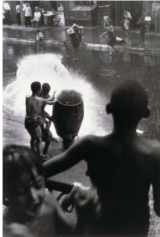
Untitled (boys playing around a fire hydrant)

The seminal book of her photographs, 'In the Street', was published in 1962 and has been re-issued twice. A large book of her works, 'Crosstown', was published in 2001, and a new book of her work, 'Here and There', will be released in February 2004. Now 90 years old, Levitt is working on a book of her color work, due out in 2005. She lives in New York City.