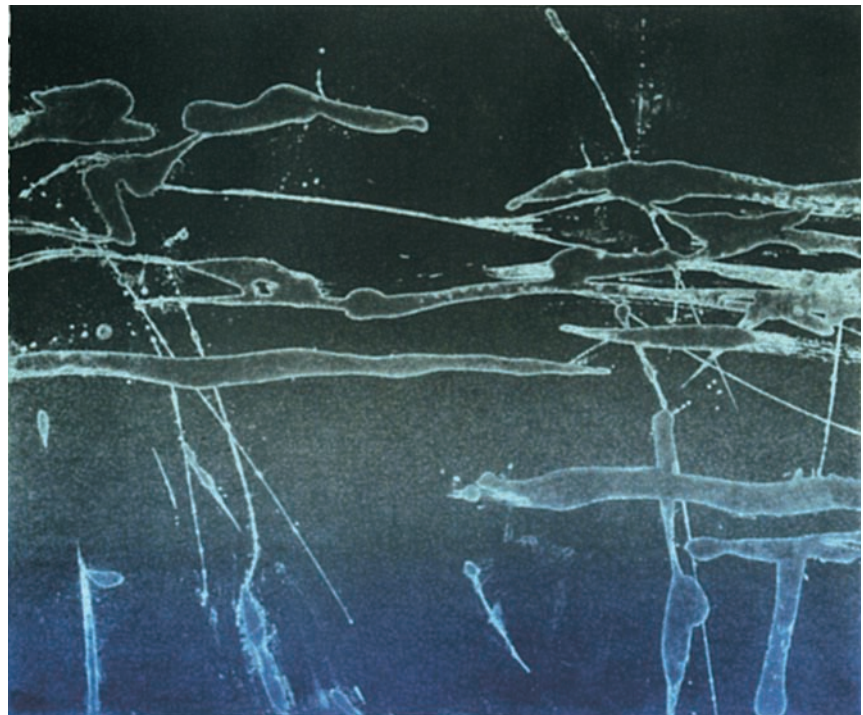
Shizukasa, 1976 Sugar-lift etching with relief roll, 22" x 30" Collection Brooklyn Museum