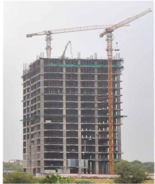
Under Construction – July, 2012