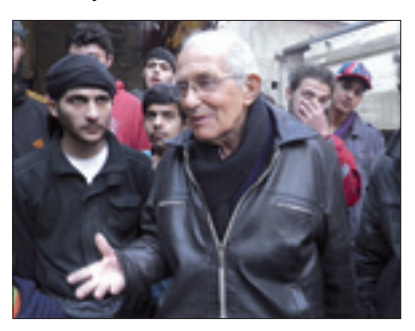
A photo of the Jesuit with a group of young people taken in January