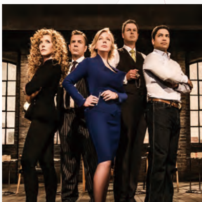
Created by Nippon Television Network Corporation; Format licensed by Sony Pictures Television