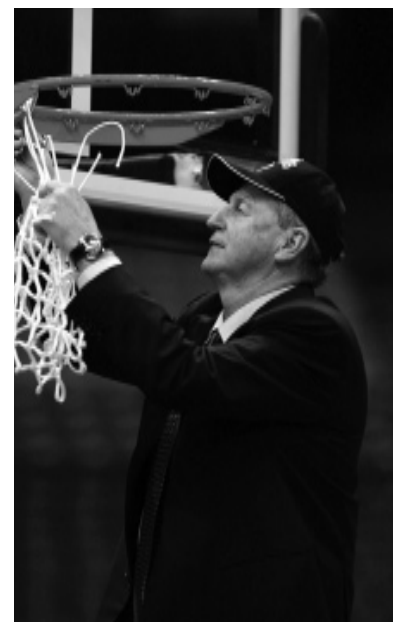
JIM CALHOUN 1986-Present 625-243 (.720)