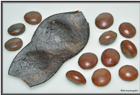
Figure 4: The seeds of Gigasiphon macrosiphon resembles those of sea beans ( Mucuna ). The tough, indehiscent seed pod contains two seeds and they appear to be adapted for drifting in water.

LINKS More Information About Figs On Wayne's Word Fig Species In The Palomar College Arboretum Links To Articles About Figs On Wayne's Word