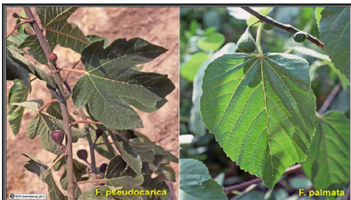
Figure 1: Ficus pseudocarica and F. palmata at test plots of UC Riverside in June 1985.

include an irrigation system and wheelchair accessible trails throughout the Arboretum.