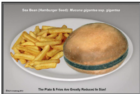
Figure 5: A sea bean Mucuna gigantea ssp. gigantea collected on a West Maui beach on 22 November 2012. It truly resembles a miniature hamburger, especially when compared with an order of fries! I must confess that I greatly reduced the size of the plate and fries. The sea bean is only 22 mm in diameter (just under one inch).

them by cuttings more than 11,000 years ago. This may be one of the earliest forms of agriculture.