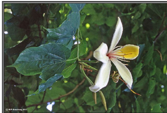
Figure 6: Although the seeds of Gigasiphon macrosiphon resemble Mucuna species, the large blossoms are very different from the pea-shaped (papilionaceous) flowers of Mucuna (subfamily Papilionoideae = Faboideae). Gigasiphon actually belongs to a different subfamily, the Caesalpinioideae. It is more closely related to Bauhinia than Mucuna .

Gigasiphon macrosiphon : A Seed That Resembles Mucuna