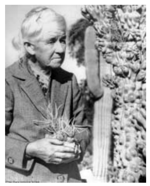
Kate Sessions by cactus, 1935.