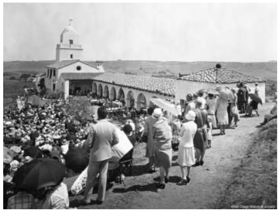
The dedication of the Junipero Serra Museum, the first home of the San Diego Historical Society, July 16, 1929. \cite{SDHS} #10311-5.