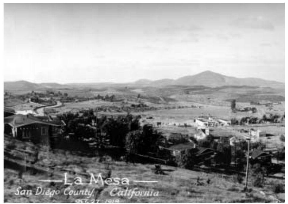
La Mesa 1919.

to ensure that his real estate ventures would have a supply of water. The initial purchasers of land would pay Fletcher for water that would in turn increase the value of all land in the area. Fletcher also believed that once settlement in the San Diego area became dense enough to allow for suburbanization east of city limits, the improvements made on these agricultural lands would increase the value of adjacent tracts.