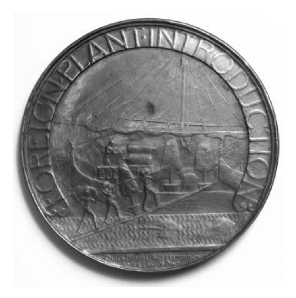
Front side of Meyer Medal.