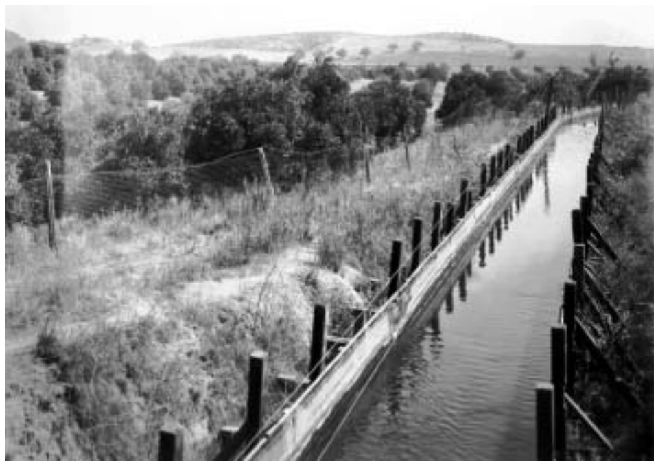
San Diego flume running adjacent to groves.