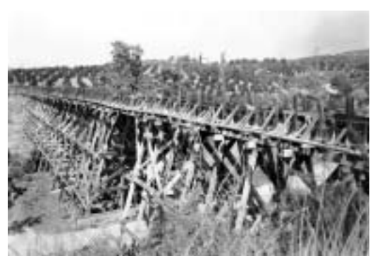
Sycamore Canyon trestle, eastern El Cajon, 1928.

mortgaged) were concerned. Increased land values might mean higher tax assessments for farmers and more limited opportunities for increasing their acreage through purchases of additional tracts. The protestants contended that with increases in land prices and water rates, only a farmer with "a little nest egg on the side" could profitably engage in raising citrus. Clarence Preston, attorney for the protestants, went so far as to suggest that conditions for citriculture were so