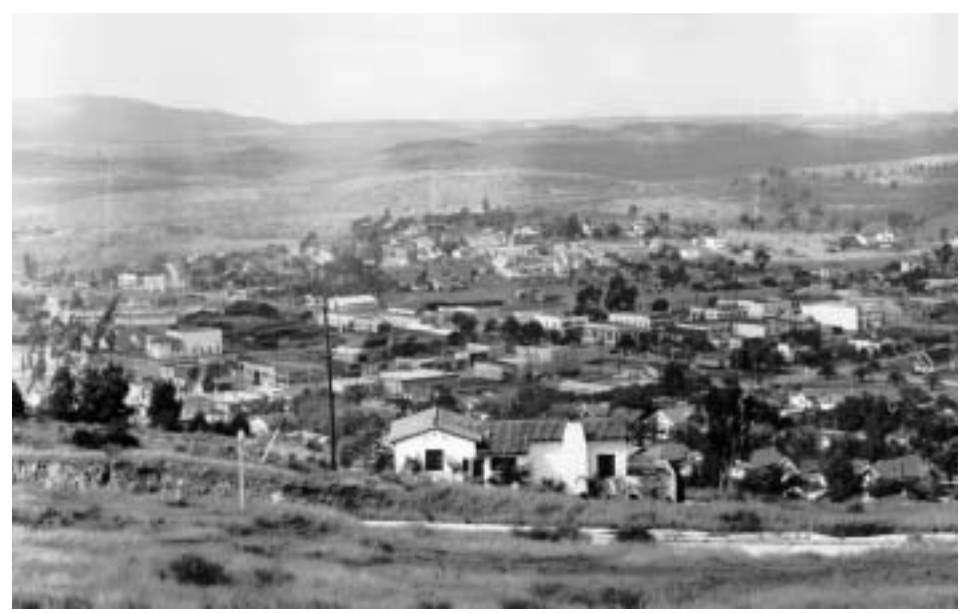
La Mesa, 1925.

appeared before the Railroad Commission at least fifteen times in hearings pertaining to water rates. Under the first rates set by the Railroad Commission, the CWC charged customers on either a domestic or irrigation scale, depending upon the size of the tract served. Customers who owned a parcel of land less than one-half acre had to pay a flat domestic rate of $1.25 per month. Tracts larger than this qualified for the irrigation rate, which was 1.25 cents per 1,000 gallons.<sup>24</sup>