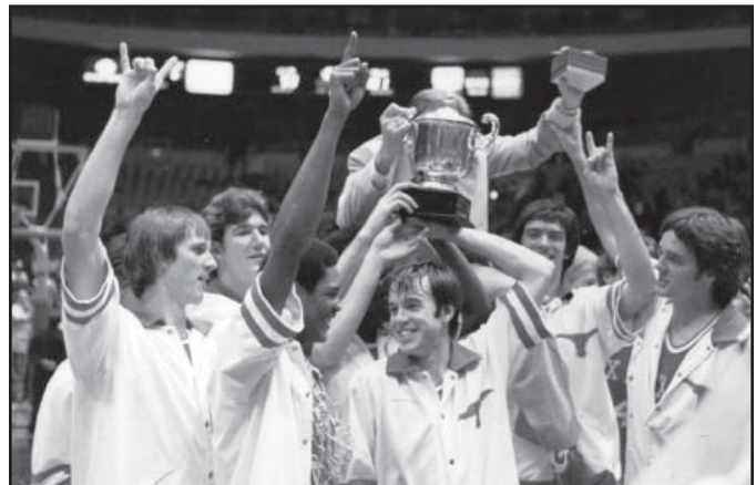
Texas' 1978 NIT Championship team celebrates at Madison Square Garden.