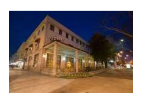
Bul. Sv. Petra Cetinjskog 2 81000 Podgorica