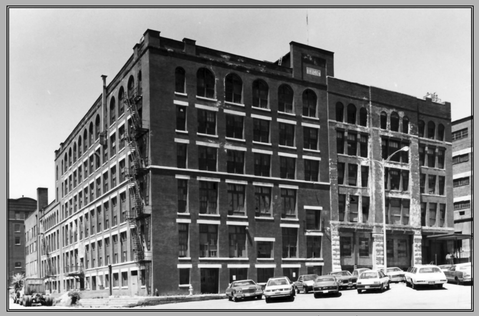
Southeast aspect. Photo by Joni Gilkerson, 1984, NSHS (8407/22:14)