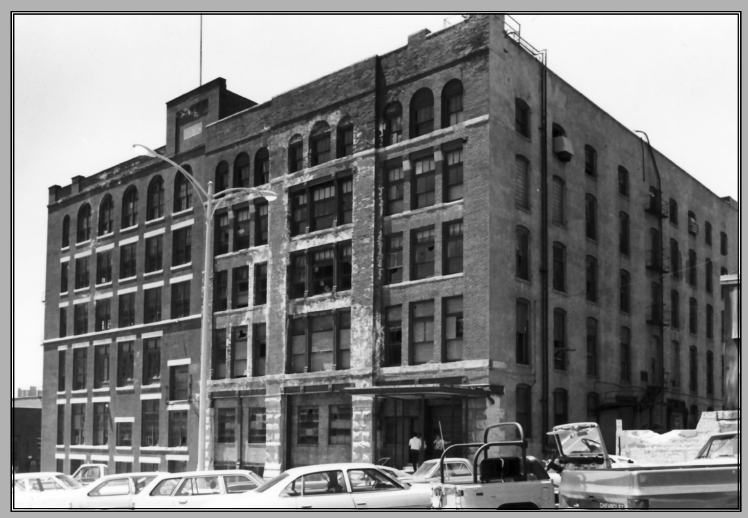
Northeast aspect. Photo by Joni Gilkerson, 1984, NSHS (8407/22:17)