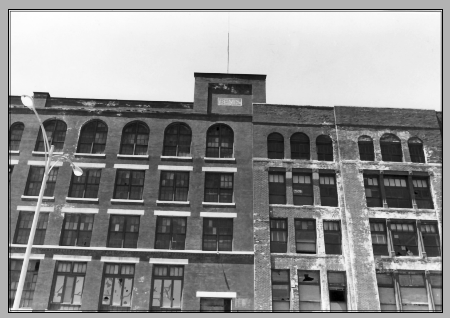
East aspect.