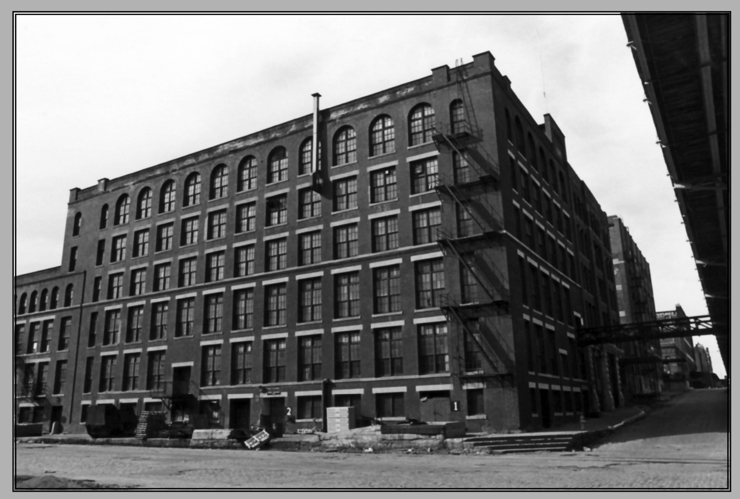
View looking northwest. Photo by P. Chatfield, 1978, NSHS (7804/4:17)