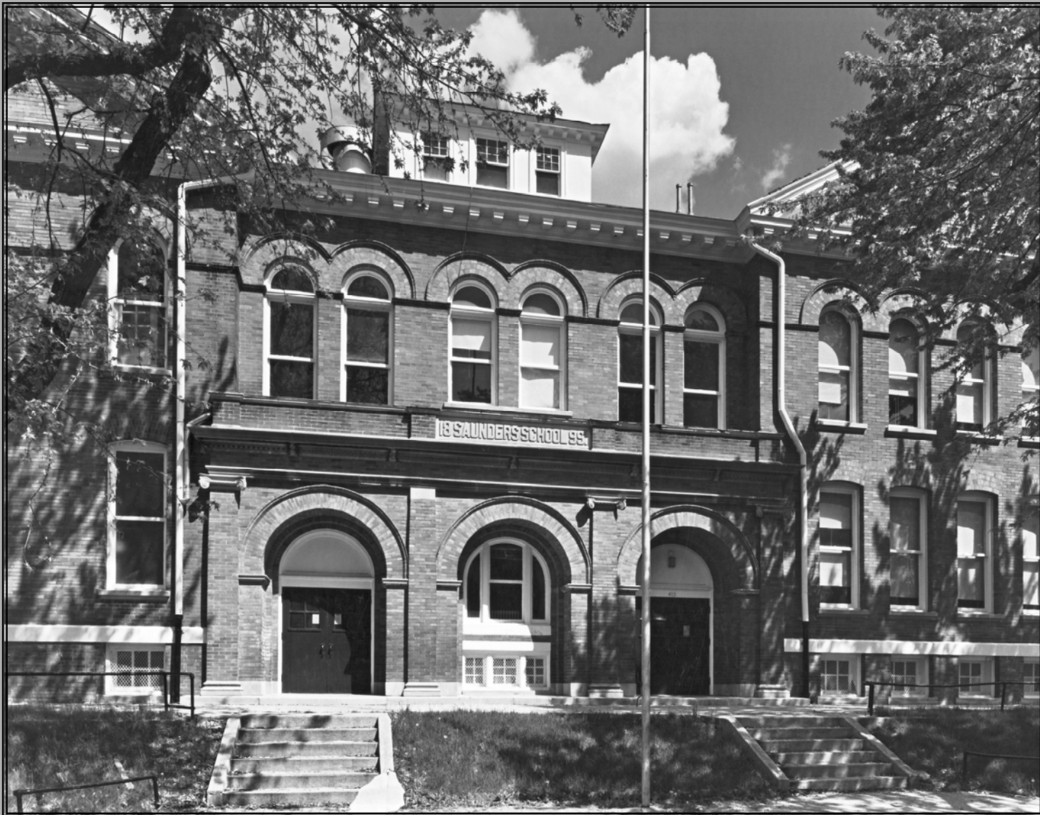
Photo 2 of 4—main entry. Photo by Lynn Meyer, 1985, Omaha City Planning Department