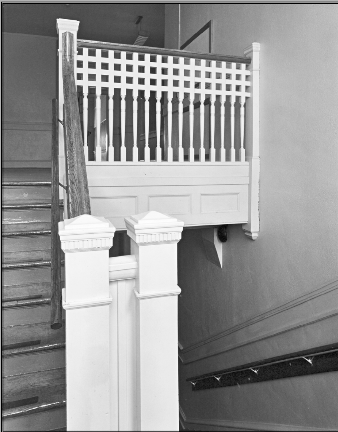
Photo 4 of 4—stair detail. Photo by Lynn Meyer, 1985, Omaha City Planning Department.