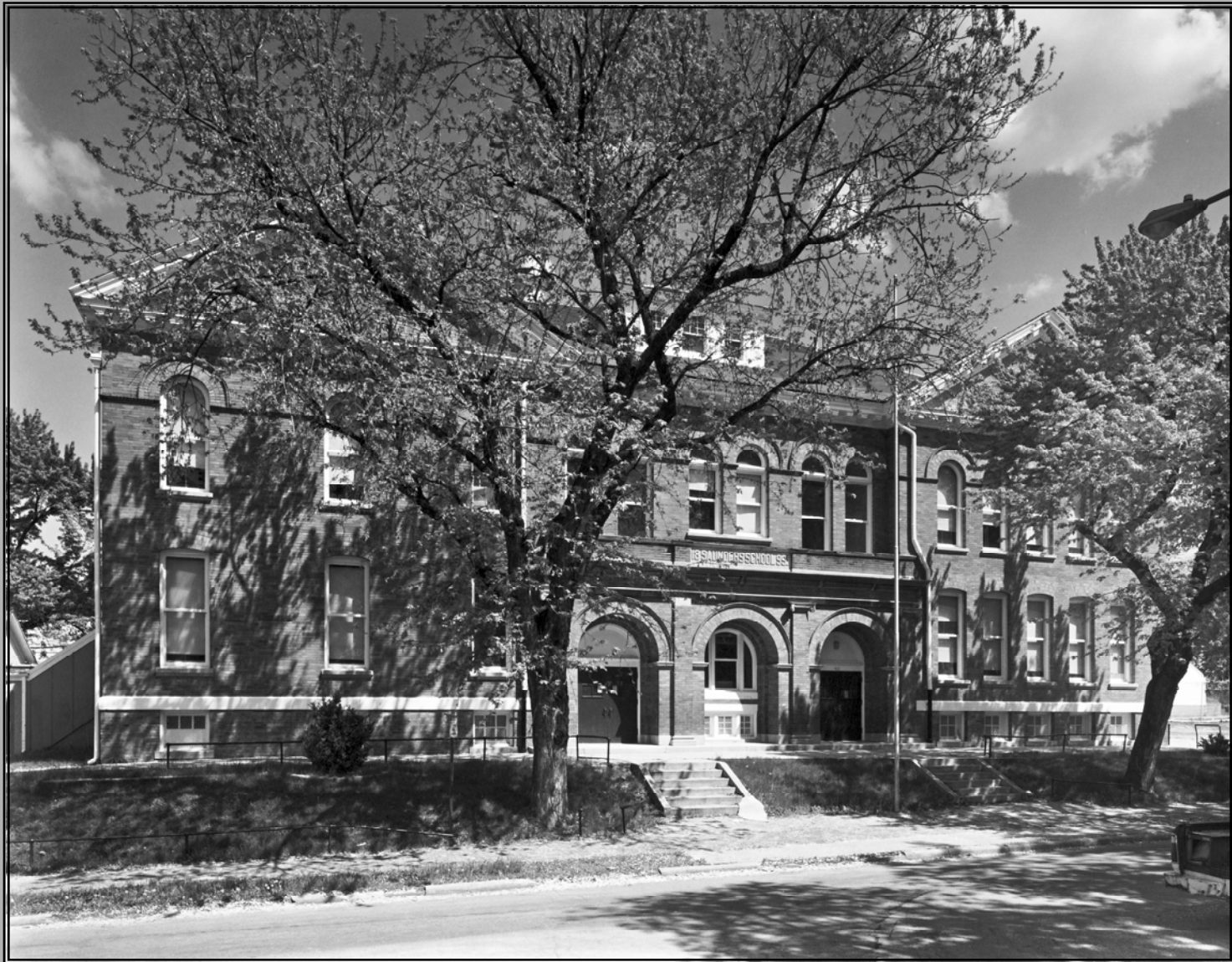
Photo 1 of 4—looking southeast at principal (west) façade. Photo by Lynn Meyer, 1985, Omaha City Planning Department.