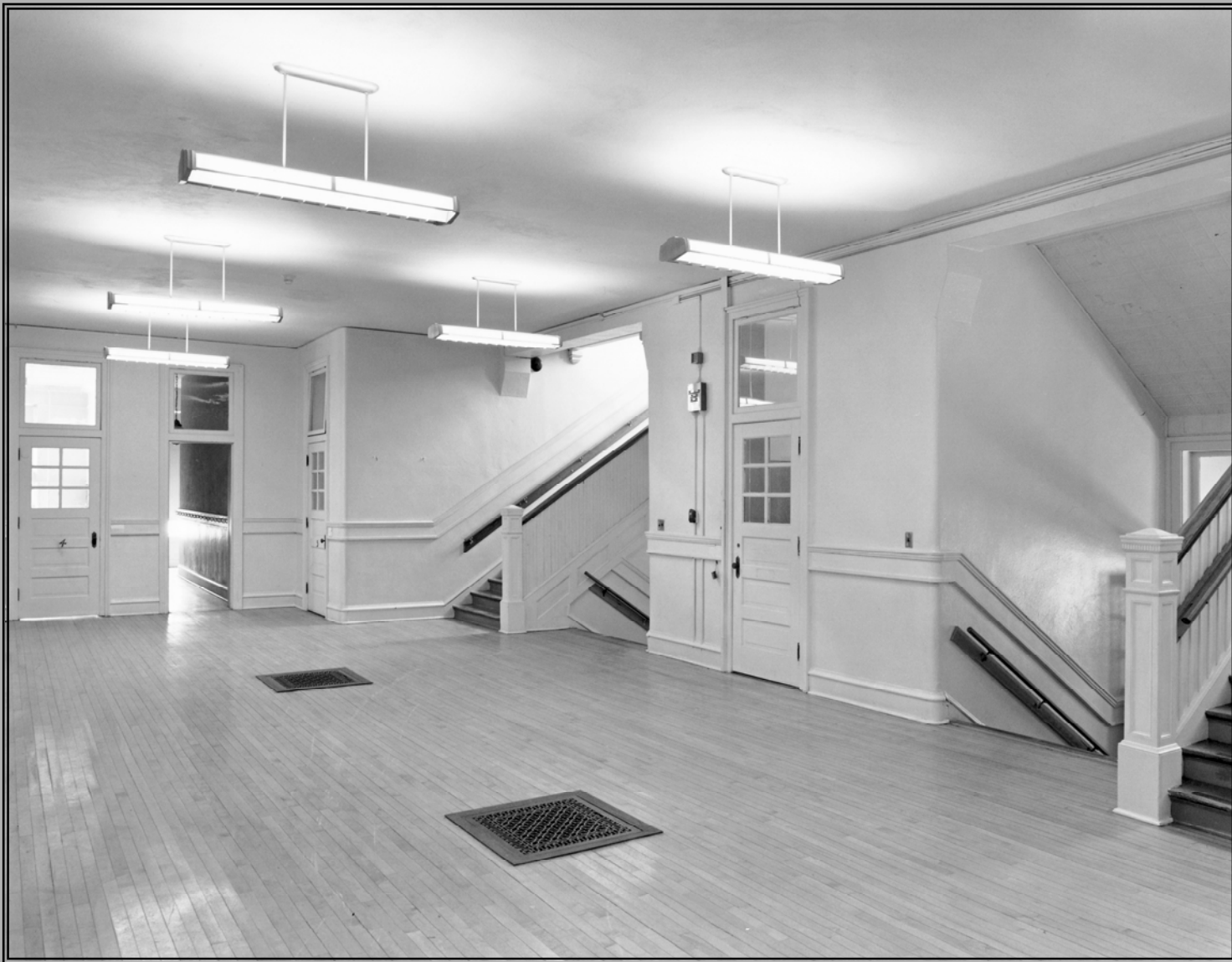
Photo 3 of 4—hallway, main floor.