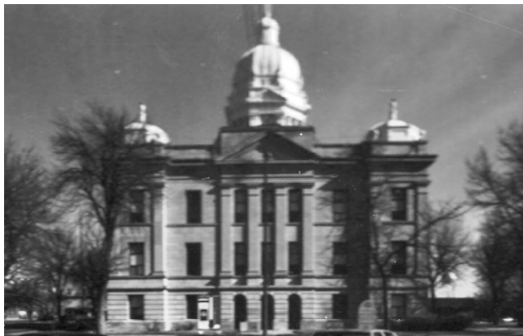
Photo 3 of 3—view looking north at south façade Photo by BJB Long, Four Mile Research, 1989 (NSHS 8904/15:10)