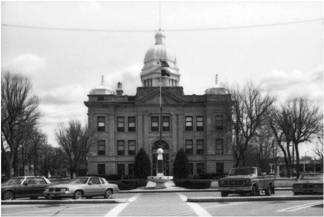
Photo 1 of 3—looking east showing west façade & WWI fountain Photo by BJB Long, Four Mile Research, 1989 (NSHS 8904/15:24)