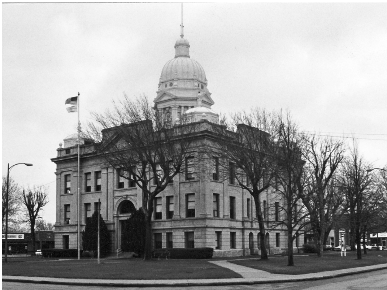
Aspect: southwest.