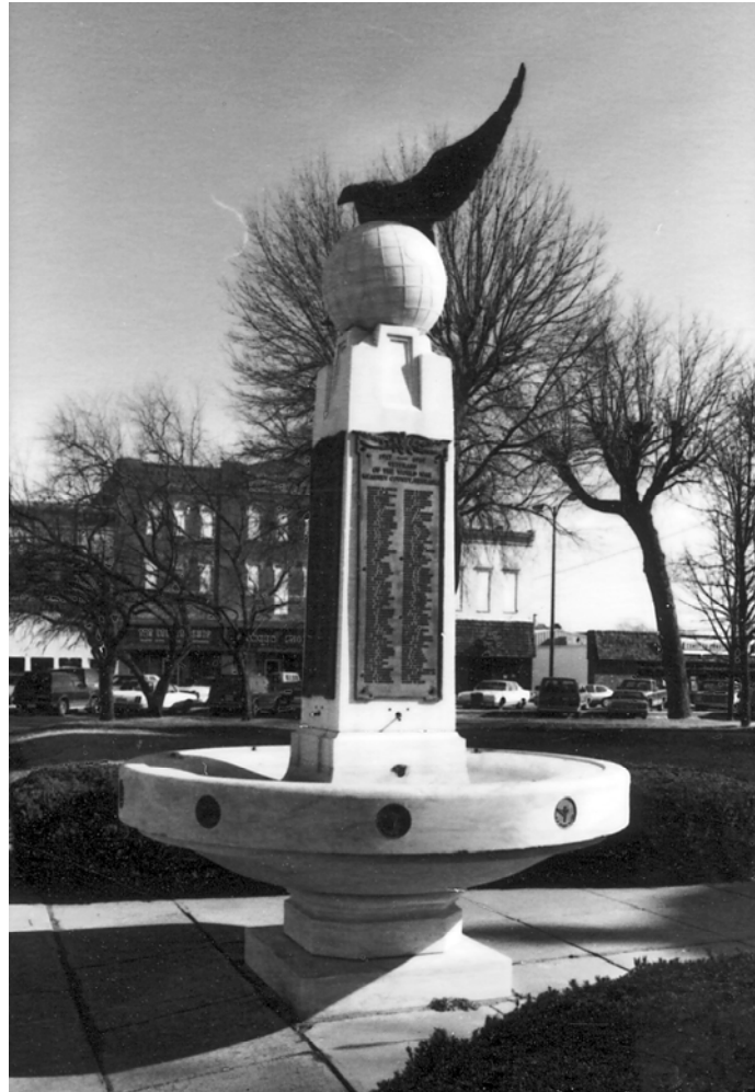
Photo 3 of 3—view looking north at WWI fountain Photo by BJB Long, Four Mile Research, 1989 (NSHS 8904/15:15)