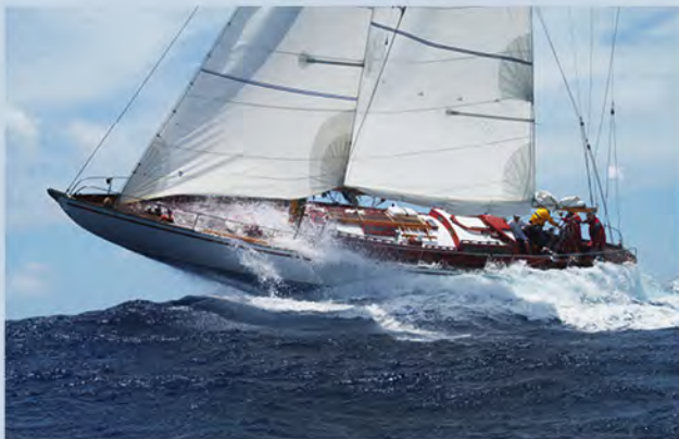
JANINA 58' BERMUDAN SLOOP