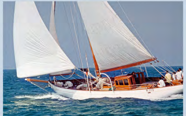
ZEPHYR J.M. SOPER & SON 62' CUTTER FROM 1929