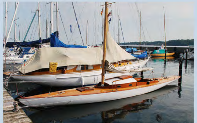
VAJO 1919 KARL EINAR SJÖGREN SQUARE-METRE SK22