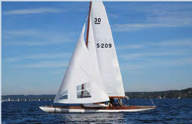
HENRIETTA 1909 SQUARE-METRE SK30