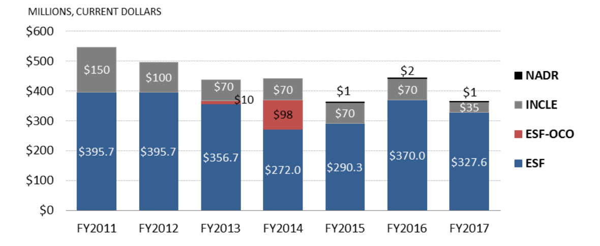
Figure 2. Detailed U.S. Bilateral Assistance to the Palestinians, FY2011-FY2017