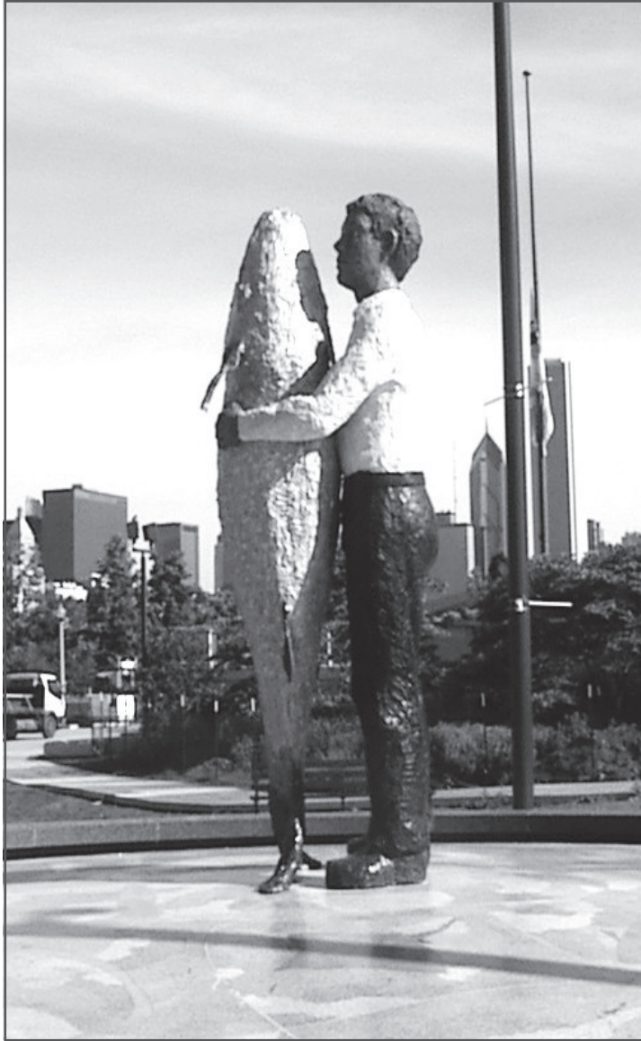
An unnamed but famous aquarium, Chicago, Illinois.