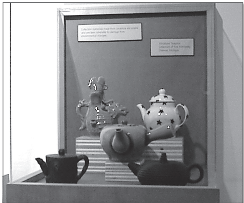
I am a little tea pot, both diminutive and rotund.

ability of upper management to hang on for dear life while jettisoning everything else. Trust me, the last person out the door is going to be some suit with a corner office, not some schlub who scrubs the tanks. (This is not meant as a knock on the administration of this particular aquarium. At least, not entirely. Rather, it’s an observation on how managers in any business possess a finely-honed sense of self-preservation.)