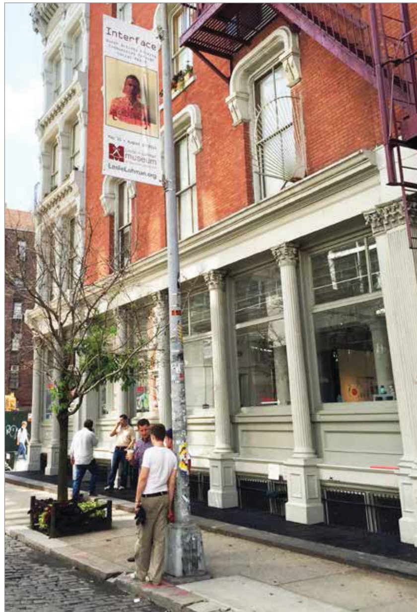
Exterior view of the space into which Leslie-Lohman Museum will expand, north to Grand St.

HOH: Another great benefit will be the ability to expand our collections area and improve our storage of objects borrowed from other institutions and individuals for exhibition. As you know, we have been borrowing more work recently from institutions such as the Smithsonian, the Library of Congress, the New York Public Library, and the Fine Arts Museum of San Francisco. With those loans come requirements regarding storage; this will allow us to better meet those requirements.