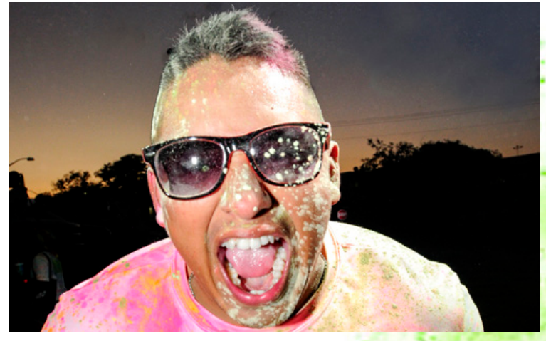
A Joint Task Force Trooper participateing in the Color Me GTMO 5K run, roars with excitement here on U.S. Naval Station Guantanamo Bay, Cuba, May 7.