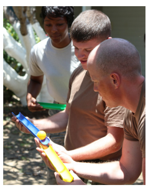
Troopers assigned to Joint Task Force Guantanamo conduct an excercise which requires them to transfer a ball from one point to another using only plastic chutes. The teamwork portion of the Coast Guard's Leadership and Management School took place May 2 to May 6 on U.S. Naval Station Guantanamo Bay, Cuba.