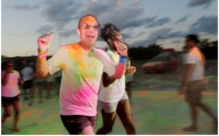
Participants in the Color Me GTMO 5K rejoice as they come to the end of the run, dripping in a rainbow of color here on U.S. Naval Station Guantanamo Bay, Cuba, May 7.