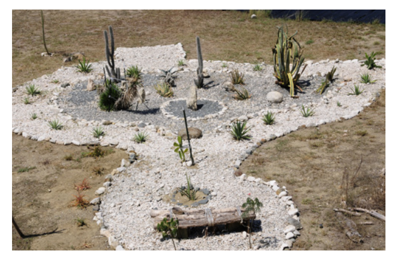
One of two cactus gardens at the plant nursery awaits the addition of lawn chairs. When the project is complete, the plants will fill in much of the empty space. The exhibit is intended to provide Troopers and residents with a quiet place to relax and unwind.

"We create all of our own water here at Guantanamo, so because of limited watering, we wanted to be able to show people the beauty of landscaping with cactus and succulents," said Misty Heath, the