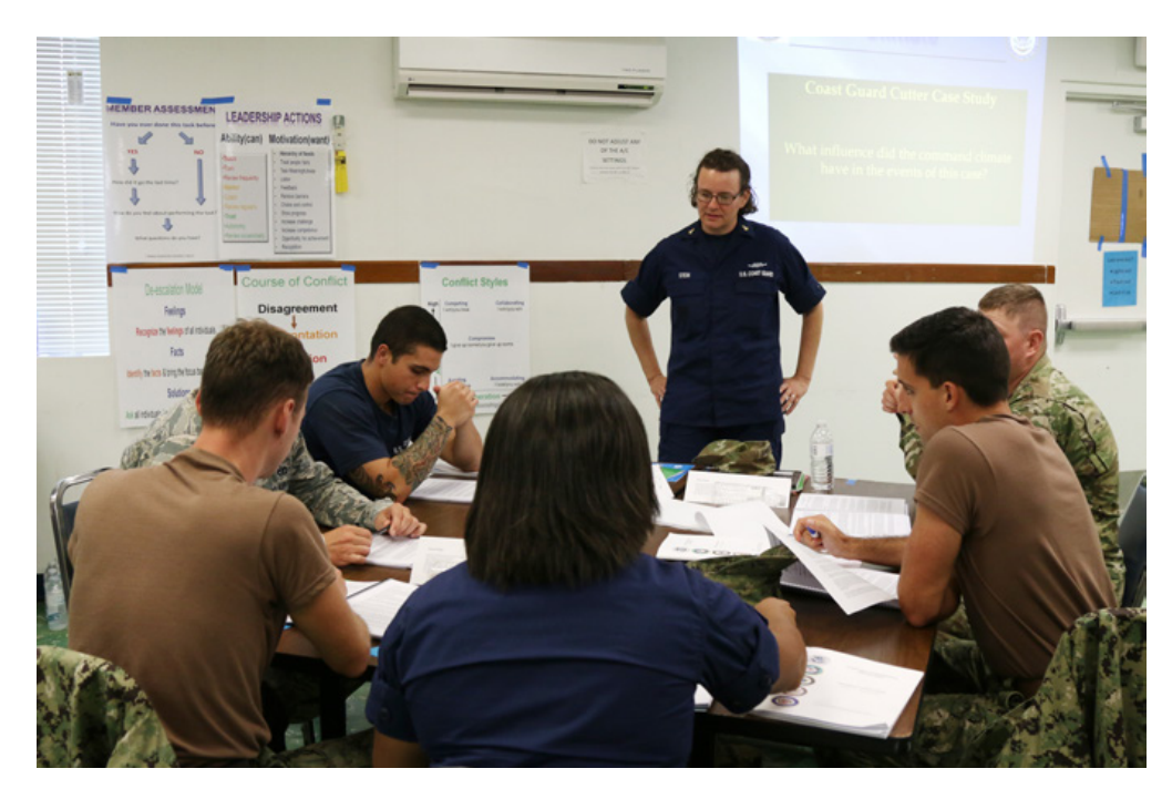
Twenty-five Troopers from the Army, Air Force, Navy and Coast Guard, assigned to Joint Task Force Guantanamo, participate in classroom training during the Coast Guard's Leadership and Management School on U.S. Naval Station Guantanamo Bay. LAMS is required for Coast Guardsmen to advance from the rank of E-5 to E-6.

Coast Guardsmen, Soldiers, Airmen and Sailors assigned to Joint Task Force Guantanamo and U.S. Naval Station Guantanamo Bay, Cuba attended the Coast Guard's Leadership and Management School, May 2-6, at the Naval Station Chapel.