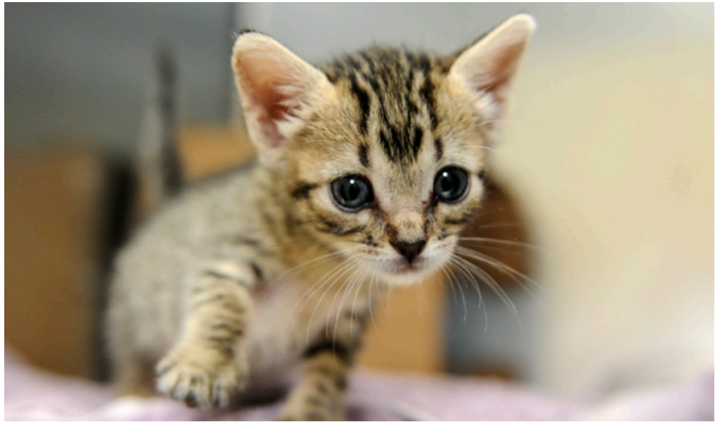
One of several kittens waits to be adopted at the veterinary treatment facility 8 April, 2016. It is important to call animal control at x90441 so the feral cats can form a better human-animal bonding to facilitate successful adoption.