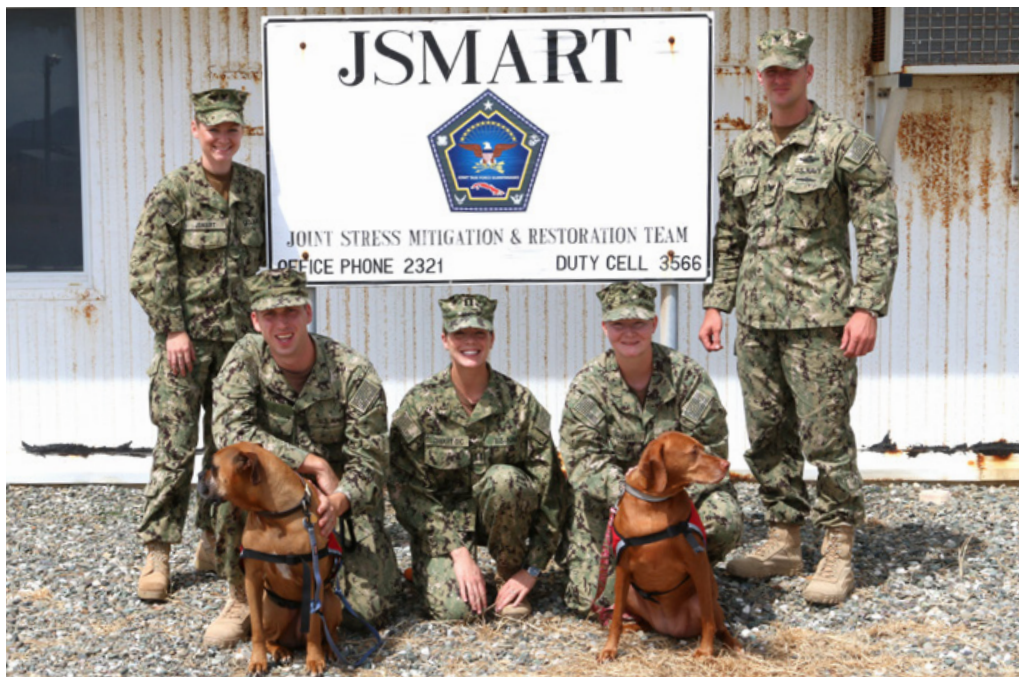
The JSMART staff spends their days seeing patients and visiting troopers assigned to U.S. Naval Station Guantanamo Bay, Cuba, and Joint Task Force Guantanamo.

Additionally, stress management is another service JSMART offers to Troopers. Some of the most common