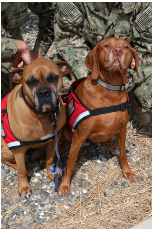
Harley and Georgyi, morale dogs at JSMART on JTF-GTMO, spend their days together, making rounds to visit troopers.