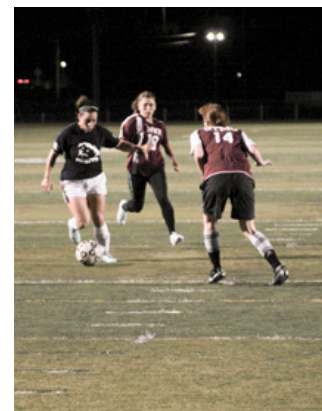
The Morale, Welfare & Recreation Women's Soccer League Championship game between Misfits and One Love on Cooper Field at U.S. Naval Station Guantanamo Bay, Cuba, April 13, drew a crowd to watch two teams battle for the title. Misfits' striker gets past one defender and has just one more to beat.

Article and photos by ARMY SGT. MATTHEW J.J. TARPLEY