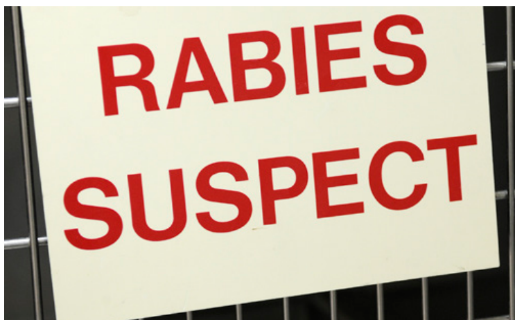
Kittens spend time in quarantine at the veterinary treatment facility to rule out the possibility of rabies after biting and scratching. It is important to call animal control at x90441 so the feral cats can form a better human-animal bonding to facilitate successful adoption.