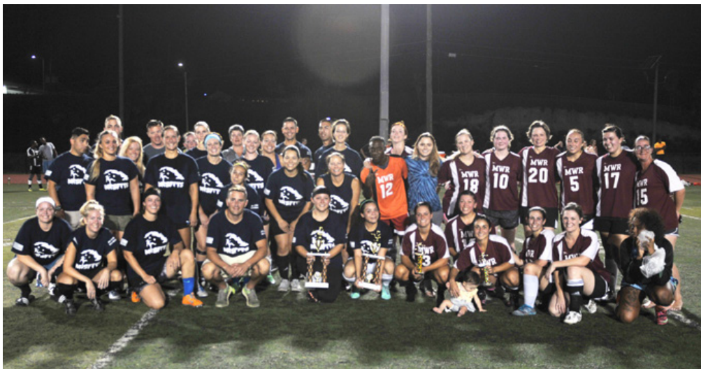
The Morale, Welfare & Recreation Women's Soccer League Championship game between Misfits and One Love on Cooper Field at U.S. Naval Station Guantanamo Bay, Cuba, April 13, drew a crowd to watch two teams battle for the title. Number 1 & 2 hold their trophies in a group photo.

The Morale, Welfare & Recreation Women's Soccer League Championship game between Misfits and One Love on Cooper Field at U.S. Naval Station Guantanamo Bay, Cuba, April 13, was a battle between the two teams to earn bragging rights. Misfits shined with a dominating performance earning them a 7-0 victory over One Love .