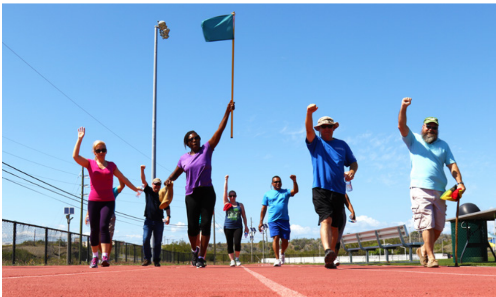
Approximately 300 Troopers and community members participated in the 24-hour Sexual Assault Awareness Walk, April 14-15 on U.S. Naval Station Guantanamo Bay, Cuba. Participants volunteered one hour to walk around the track here, carrying the teal flag.

The sun was shining bright at 4 pm April 14 on U.S. Naval Station Guantanamo Bay, Cuba when the first group of volunteers stepped on the track at Cooper Field, holding a teal flag, to raise awareness of sexual assault to the community here.