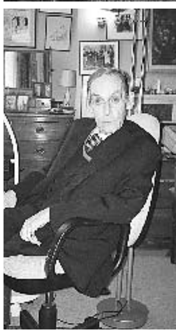
Jeremy Thorpe in 2008

landslide. 'I captured the seat thanks in part to its Liberal tradition', he says modestly although in truth to win in 1959 was just as much a tribute to Thorpe's outstanding campaigning skills. The 1950s saw the Liberal Party reach a nadir in its fortunes, with the Conservative and Labour parties hogging the central ground in politics, and as a result many called into question the Liberals' continuing existence. And with just a handful of MPs, Thorpe readily admits: 'We came very close to extinction during the decade.'