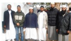
Ex-Guantanamo Detainees Return to Violence