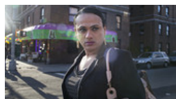
Asylum Policy Gives Inside Track to Gays