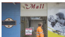
Australian Town Feels Commodity Slump