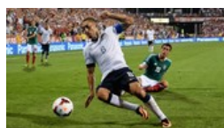
Soccer, Made in America