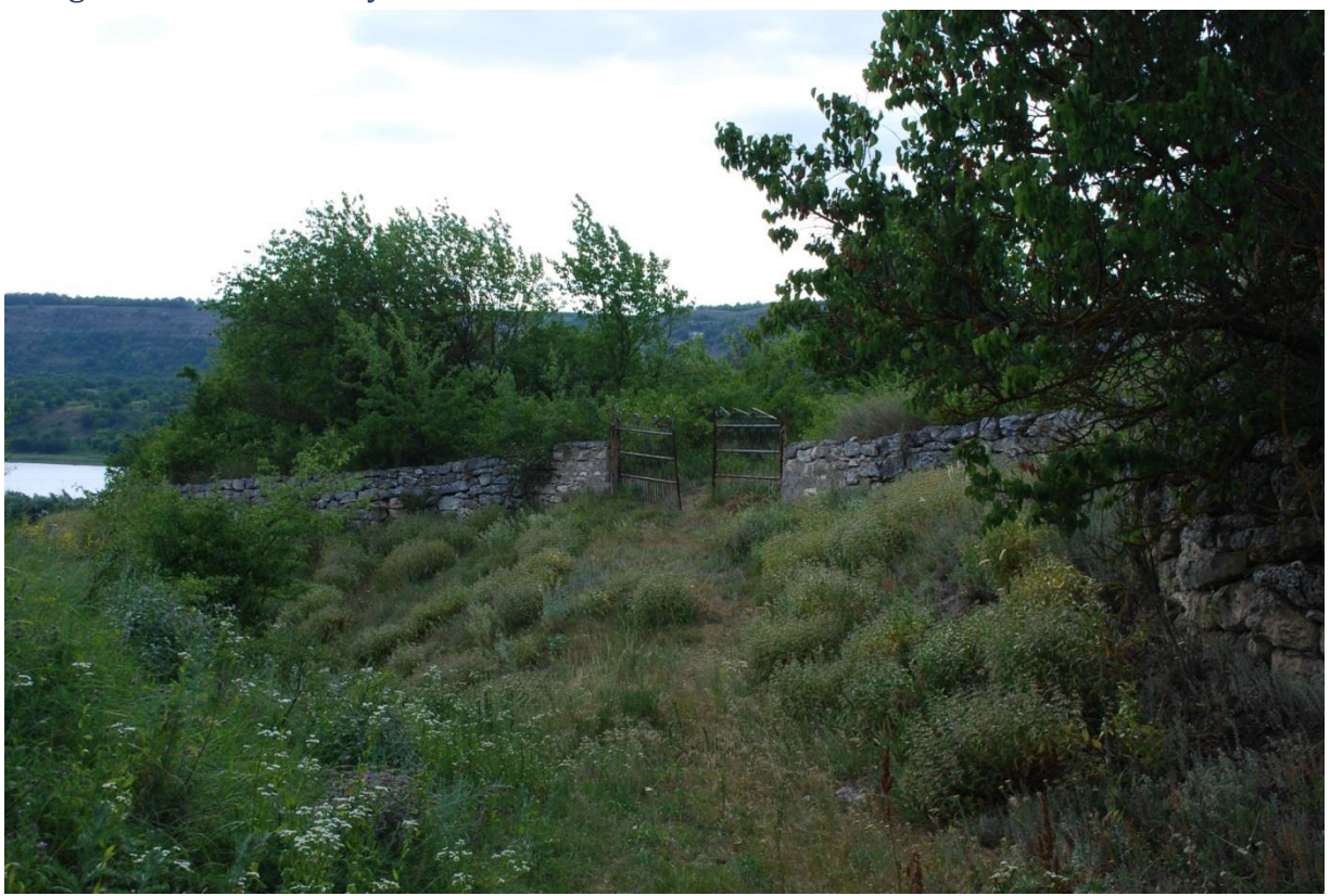
The gates to the Rashkov Jewish Cemetery