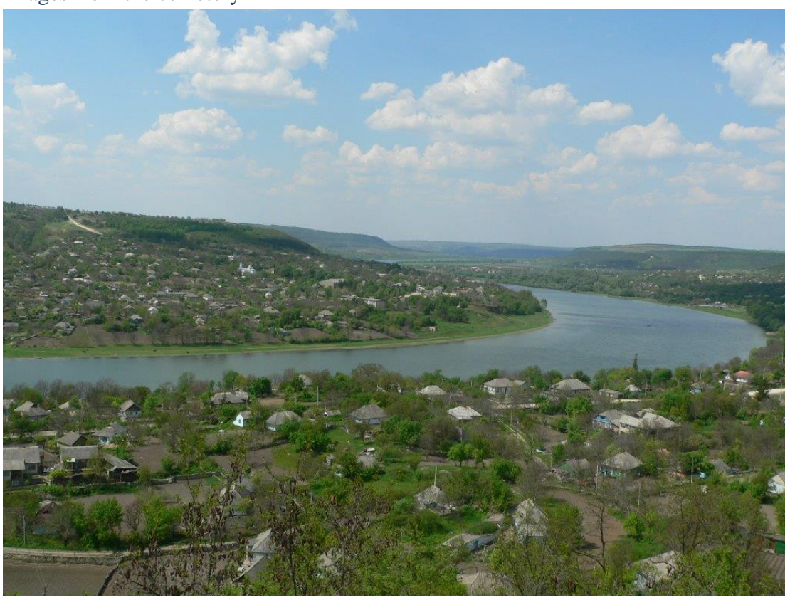
Overview of Rashkov and Vad-Rashkov on two sides of Dniester River