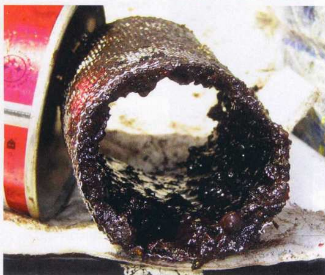
As fuel deteriorates in storage, the residue from degradation begins to plug fuel filters. The photo of the filter above was taken from a diesel powered pumping station designed to ward off flooding in a low lying area. With a failure in the system, hundreds of homes are put at risk.

The weakest link is almost always fuel, for when an emergency fuel supply is stored unused month after month, year after year, it deteriorates. Degraded fuel becomes gummy, fouling and plugging fuel filters. Poor ignition quality results in increased ignition delay, each piston fighting against the other. Excessive carbon soon fouls fuel injection systems – eventually pinching off the fuel supply to the cylinders.