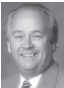
Dr. James Andrews Orthopaedic Surgeon