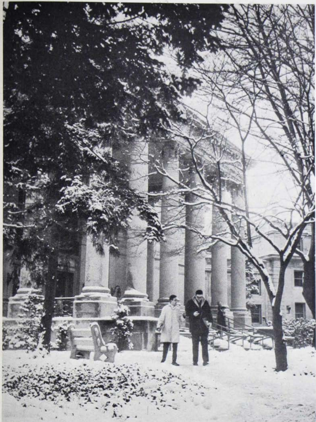
Winter on the campus of Monmouth College, where Delta-Beta was chartered, presents a scene of beauty and grace.