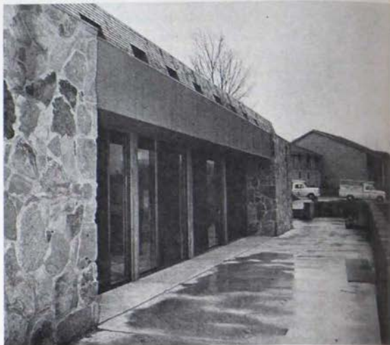
The terrace of Beta's new home on Indiana University's fraternity row.

During this semester Alpha Chapter bought a second house to accommodate our expanding chapter. The annex, located at 515 N. 6th St., next to Bayard Place, is an average, two-storied, wood-structured house that will accommodate comfortably 20 Brothers and our wonderful housemother. The annex differs from Bayard Place, since its sleeping quarters are in different rooms and no meals are served. We have been busy renovating it, and things are taking shape. Our Brothers are ready to settle down in this