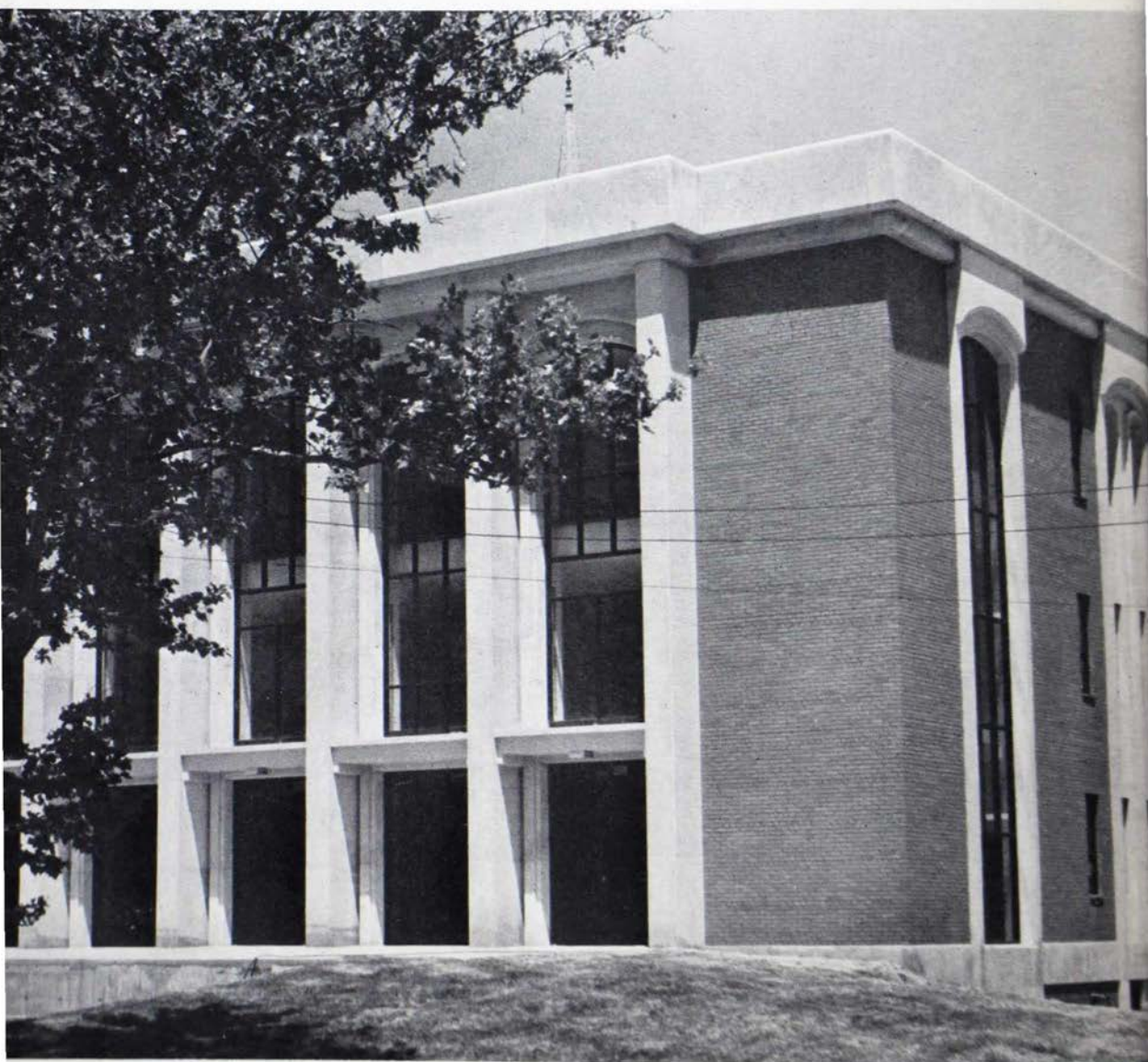
Ritter Hall, home of the St. Louis University School of Arts and Sciences, on the campus of the Fraternity's Gamma-Psi Chapter

SIGMA PI PARENTS: Your son's magazine is sent to his home address while he is in college. We hope that you enjoy seeing it. But if he is not in college and is not living at home, please send his permanent address to Sigma Pi Fraternity, P.O. Box 1897, Vincennes, Indiana 47591.