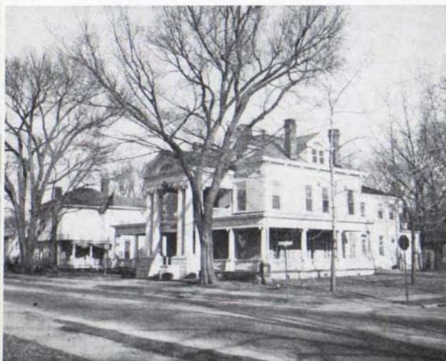
Alpha's newly-acquired annex is pictured here to the left of the Chapter's home, Bayard Place, in Vincennes.

The improved study conditions will help Beta in her quest for the all-campus scholarship trophy. The house's rising grades look promising. As further proof of Beta's rise, we initiated 23