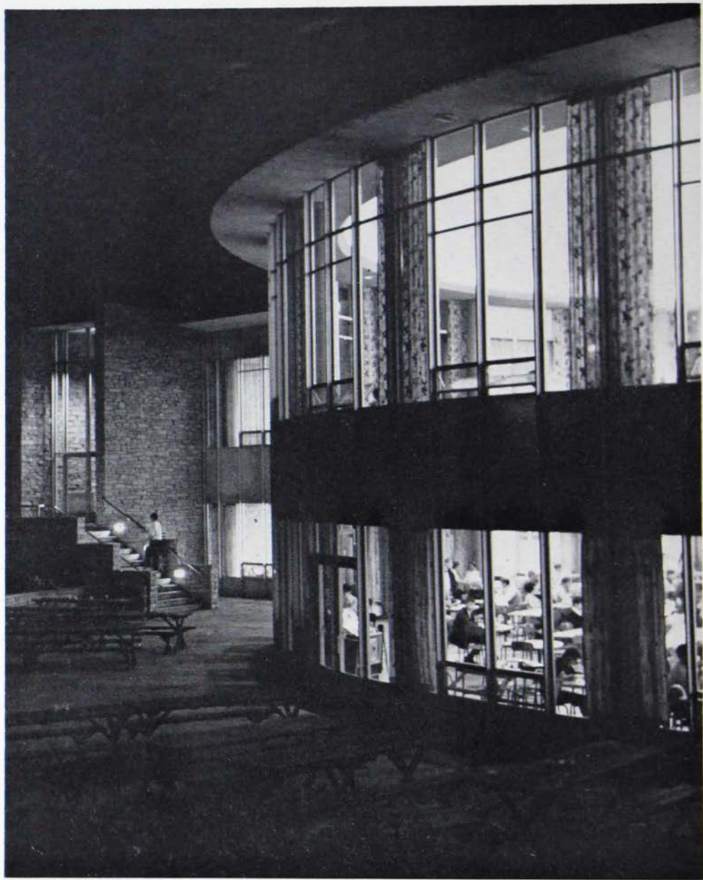
The dramatic architecture of the Central Michigan University Student Center is vividly illustrated in this night photograph. The University is the home of Delta Alpha Chapter.