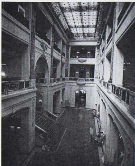
The interior of Woodrow Wilson Hall, formerly Shadow Lawn Estate, at Monmouth College.

Shadow Lawn, the site of the Monmouth College campus since 1956, has a long and interesting history which includes a period when it served as the summer White House.