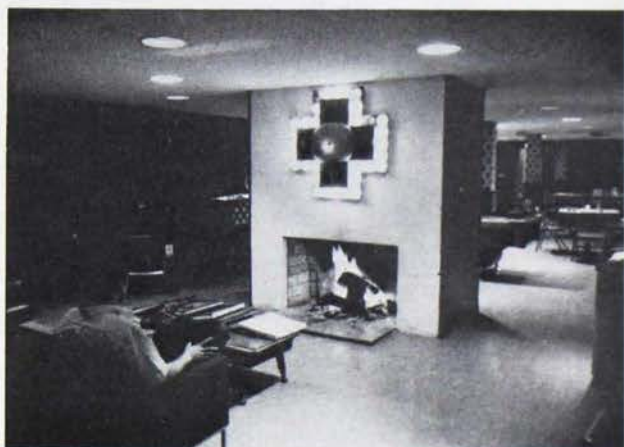
TOP: An exterior view of Beta-Phi's new home on the campus of Rochester Institute of Technology. BELOW: The chapter room and dining hall of Beta-Phi.