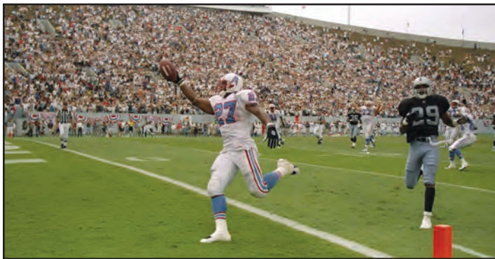
George posts a record game against Oakland in the 1997 regular season opener