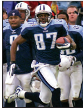
Dyson races down the sideline in the Music City Miracle

January 23 – The Titans beat Jacksonville for the third time of the season and fifth consecutive time, using 23 second-half points en route to a 33-14 win at Alltel Stadium in Jacksonville. Steve McNair runs for two touchdowns and Derrick Mason returns a kickoff 80 yards in the win. The win sends Tennessee to its first Super Bowl in franchise history and its first AFC/AFL Championship since 1961.