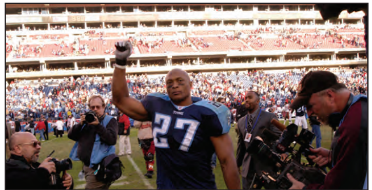
George salutes the fans following his final home game as a Titan

December 28 – Recently re-signed QB Neil O'Donnell starts following injuries to Steve McNair and Billy Volek. He threw for 232 yards and a pair of touchdowns in Tennessee's season-ending 33-13 victory over the defending Super Bowl Champion Tampa Bay Buccaneers. It marked O'Donnell's last NFL game as he would announce his retirement following the season. Eddie George becomes the 17th running back in NFL history to record 10,000 rushing yards in the team's victory over the Bucs. George rushes for 87 yards to push him over the 1,000-yard rushing mark for the seventh time in his eight NFL seasons. It marked the final regular season game and the final home game for George as a Titan.