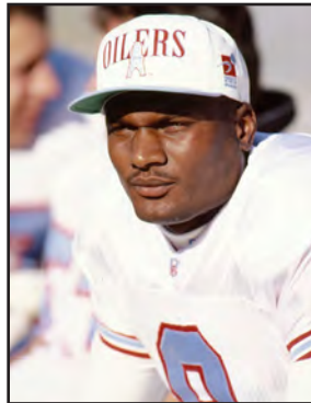
The Oilers draft McNair in 1995

April 20 – After trading down in the first round (from 9th to 17th) to acquire extra picks from Oakland, General Manager Floyd Reese and Head Coach Jeff Fisher execute a trade with the Seattle Seahawks to move back up to the 14th spot in the 1996 draft to select Heisman Trophy winner