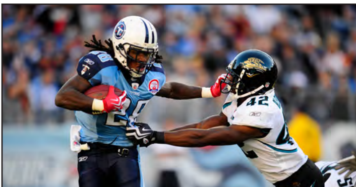
Johnson rushes for a franchise single-game rushing mark of 228 yards

November 1 – At LP Field, Chris Johnson rushes for 228 yards in a victory over the Jacksonville Jaguars to set a new franchise single-game rushing record.