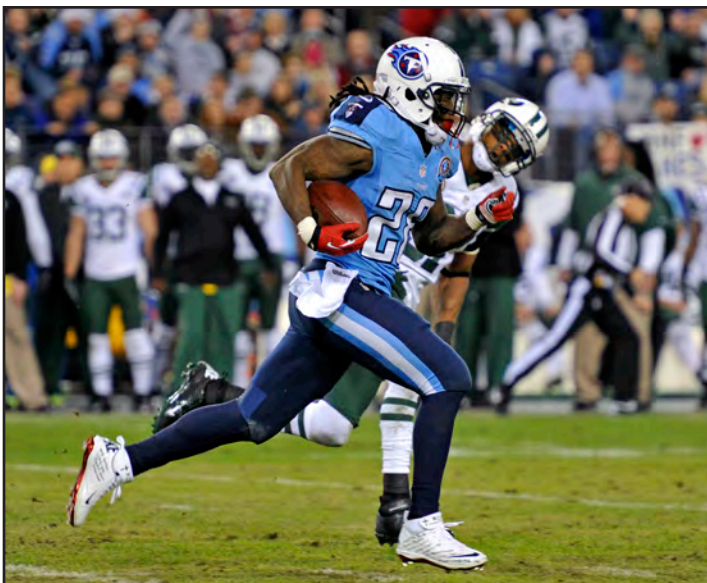
Chris Johnson's 94-yard touchdown run against the Jets in 2012 set a franchise record.

December 17 – In a 14-10 victory over the New York Jets on Monday Night Football , Chris Johnson sets a franchise record with a 94-yard touchdown run.