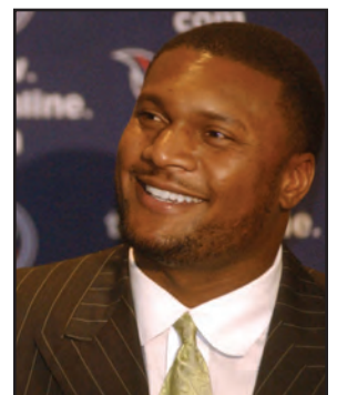
McNair is named NFL co-MVP in 2003

January 23 – TE Frank Wycheck announces his retirement from the NFL after 11 seasons in the league.