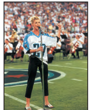
Faith Hill sings at inaugural game of the new stadium

December 26 – Tennessee defeats Jacksonville for the fourth consecutive time, a 41-14 victory in which Steve McNair throws five touchdown passes. McNair earns his first AFC Offensive Player of the Week and his second Miller Lite NFL Player of the Week honor this season for his efforts. The win completes the first unbeaten home regular season in club history.