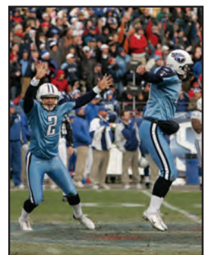
Bironas celebrates following his 60-yard goal against the Colts