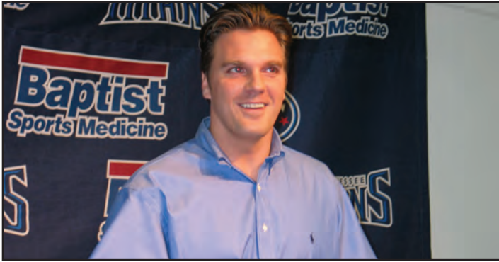
Wycheck, the fourth tight end in NFL history to record 500 receptions, announces his retirement

April 24 – Titans select a league-high 13 players in the 2004 NFL Draft, including three players in the second round (the team traded its first-round pick) – TE Ben Troupe, DE Travis LaBoy and DE Antwan Odom.