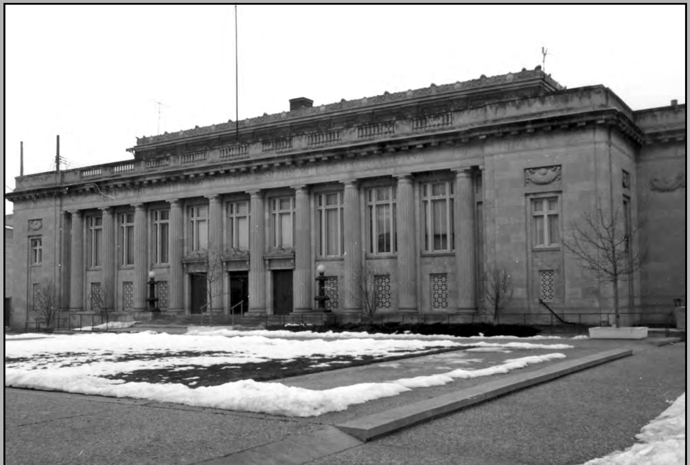
Aspect: west. Photo by D. Murphy, Lincoln, NE, 1975 (DM7502-2:13)