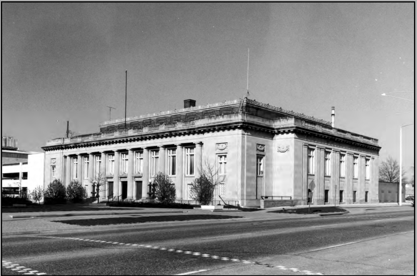
Aspect: southwest. Photo by D. Murphy, Lincoln, NE, 1976 (DM7604b:18)