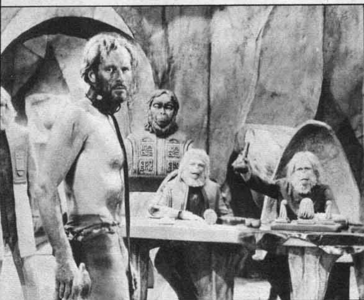
Astro/temponaut Charlton Heston in the original PLANET OF THE APES .