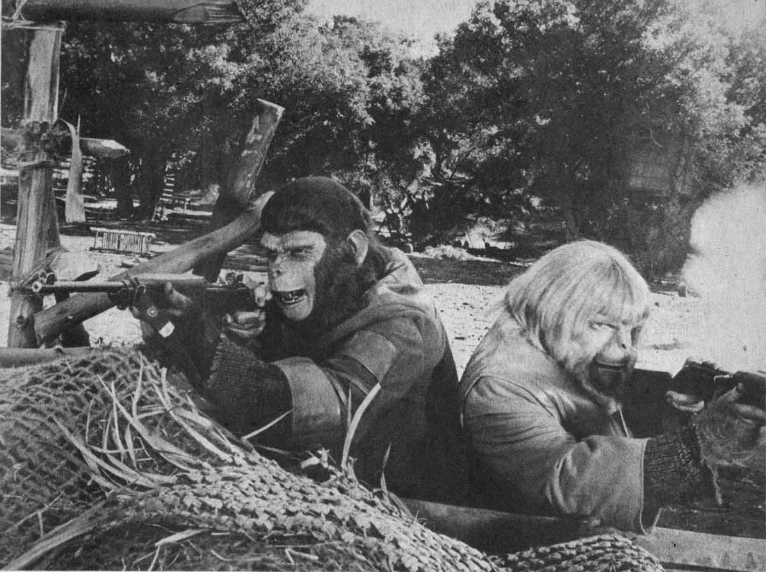
Holding off the mutants at the barricades in BATTLE FOR THE PLANET OF THE APES , Arthur P. Jacobs' final film.

payoff for him was always the thrill of discovering stories with a strong potential for transmutation to celluloid, the challenge of working with creative people to whip the material into cinematic shape, casting it imaginatively & packaging the product handsomely."