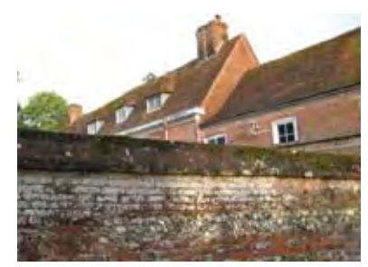
A variety of materials and styles is visible: capped cob and brick walls, hedges and wooden fences. Leylandii hedging and close board fencing are