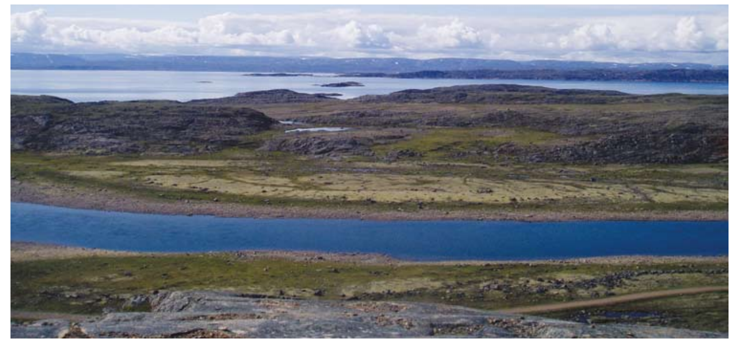
Nunavut Parks & Special Places – Editorial Series