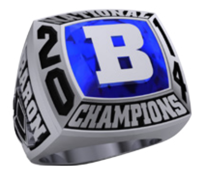
SINGLE STONE SETTING