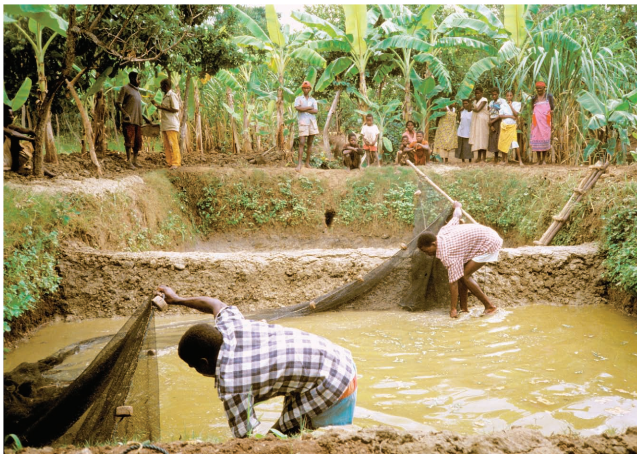
Fish farms, such as this one in Malawi, represent an important source of food and income for people throughout Africa. However the traits that make species such as Oreochromis niloticus suitable for aquaculture mean that they pose a significant threat to local species should they escape.

As noted above, a new subspecies of Oreochromis was recently discovered from the Lake Bogoria Hotel spring near the Lobo swamp. This population was formerly