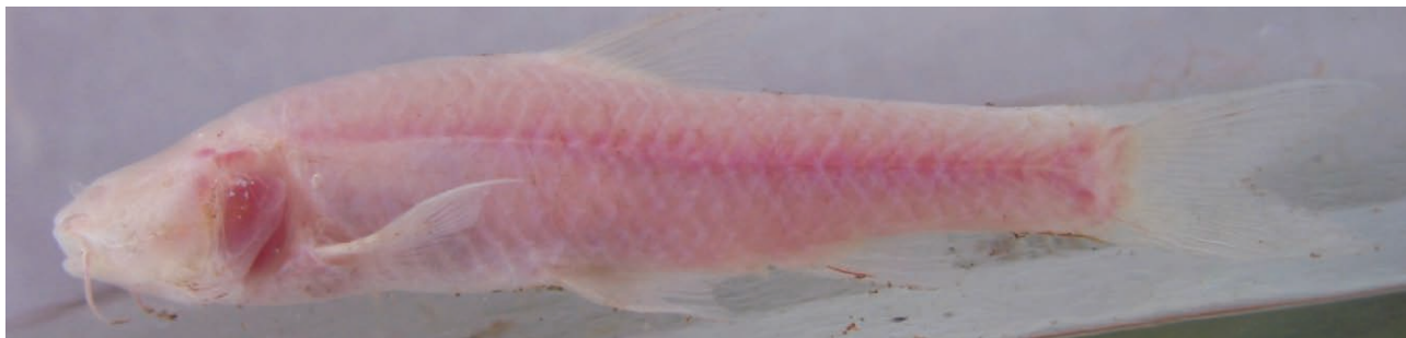
A live specimen of Caecobarbus geertsii from the cave 'Grotte de Lukatu', D. R. Congo.

Vreven, E. 1 , Kimbembi ma Ibaka, A. 2 and Wamuini Lunkayilakio, S. 2