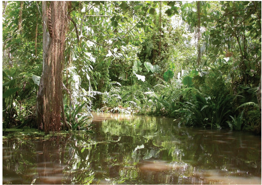
Lokoli swamp forest in southern Benin. This small forest fragment serves as one of the last refuges for many forest dwelling species.

The high number of unconnected coastal rivers in western Africa is thought to have promoted these speciation processes, which have led to noticeably high levels of endemism, such as for characids, barbs and cichlids. Furthermore, several remarkable fishes, which are sometimes called 'relict' species, occur in the Guinean regions. These species belong to phylogenetically old groups previously represented by more numerous and widespread species but, following evolutionary events, now represented by only a few, often locally restricted