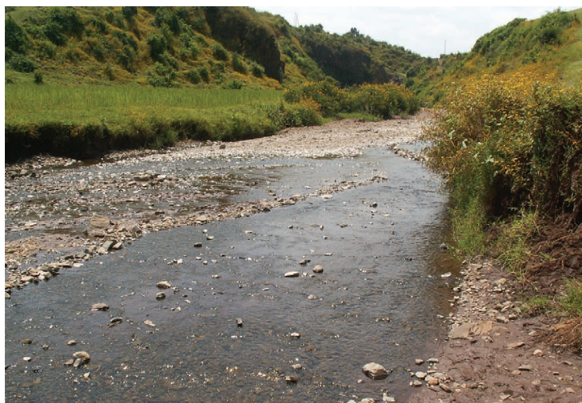
Many of the Labeobarbus species migrate up the rivers flowing into Lake Tana to spawn in gravel beds, such as seen here in the Gumara River.

Run-off from small-scale agriculture around the lake is bringing agricultural fertilizers, pesticides (including DDT), and herbicides into the lake. The use of these agricultural products by farmers is still relatively limited; however, a lack of effective regulation on their use presents a potential threat to water quality in the lake. Other chemicals, such as 'birbira' ( Milletia