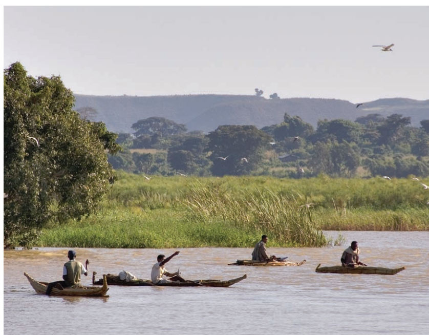
Fishermen cast their lines from papyrus boats ("tankwas") on Lake Tana in northern Ethiopia. Behind them lies the source of the Blue Nile. Near Bahir Dar, Ethiopia.

Although a fishery policy has been developed both at federal and regional levels, it is not effectively