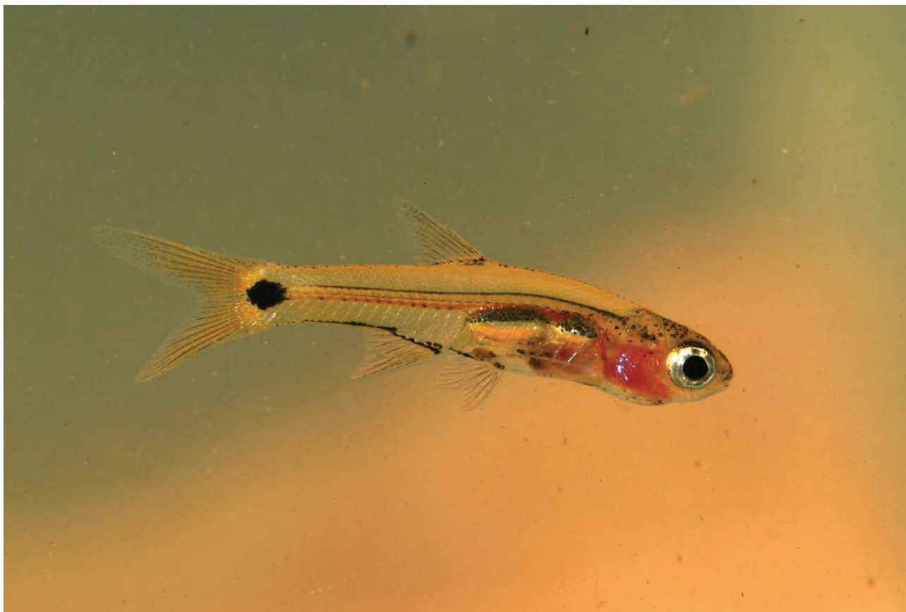
Barboides britzi , one of Africa's smallest freshwater fish, is a newly described species endemic to Lokoli forest in Benin.