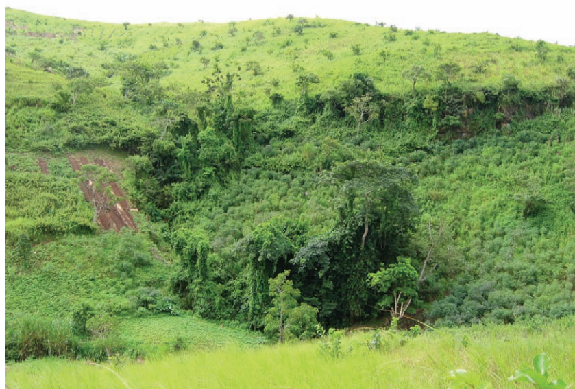
Land use around the entrance of the 'Grotte de Lukatu', with subsequent landslides visible (9 March 2007). The entrance to the cave is directly below the largest trees in the middle of the photograph.

1,500 individuals to the United States (Proudlove and Romero 2001). Three other primary threats to the species were identified by Brown and Abell (2005): changes in hydrology of the small rivers feeding the caves; increasing human population; and associated deforestation (Kamdem Toham et al. 2006). Since 2003, with the attenuation of the political situation in D. R. Congo and the rehabilitation of the Matadi-Kinshasa road, there has been a significant influx of rural people towards Mbanza-Ngungu. Consequently, land use has increased around Mbanza-Ngungu for buildings as well as agriculture. One cave is now used as a quarry, with consequential loss of the Caecobarbus population (Leleup 1956; Poll 1956; and see above), and others are at risk of collapse due to human disturbance (Kimbembi 2007; Moelants 2009). Agriculture is practiced preferentially in the valleys near to the caves but may also occur on the hillside slopes surrounding and covering the caves, leading to increased erosion and landslides. In the past, these areas were covered with lowland rainforest and secondary grassland (White 1986), limiting erosion. Further research and conservation initiatives in the field are necessary if this unique species of fish is to survive.