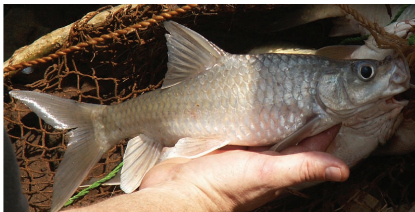
Labeobarbus macrophthalmus is a benthopelagic species that forms an important component of the Lake Tana fishery.

There are 28 species of fish in Lake Tana, of which 20 are endemic to the lake and its catchments (Vijverberg et al. 2009). The fish fauna includes representatives of the genera Oreochromis , Clarias , Labeobarbus (i.e., the ‘large African barbs’), Barbus (i.e., the ‘small Barbus group’; see De Weirtd and Teugels 2007), Garra , Varicorhinus and Nemacheilus . The population of O. niloticus in Lake Tana was described as a separate sub-species, Oreochromis