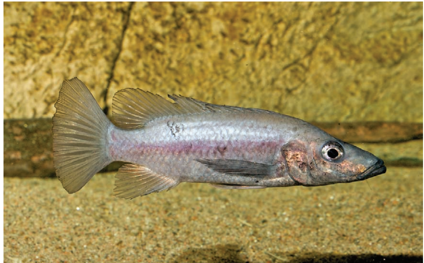
Stomatepia mongo , a Critically Endangered cichlid endemic to Lake Brombi Mbo, Cameroon.

Crater lakes everywhere may contain a substantial number of endemic fishes and other aquatic and amphibious taxa. Among African fishes endemic to craters, small phyletic and trophic assemblages of species and genera representing the family Cichlidae