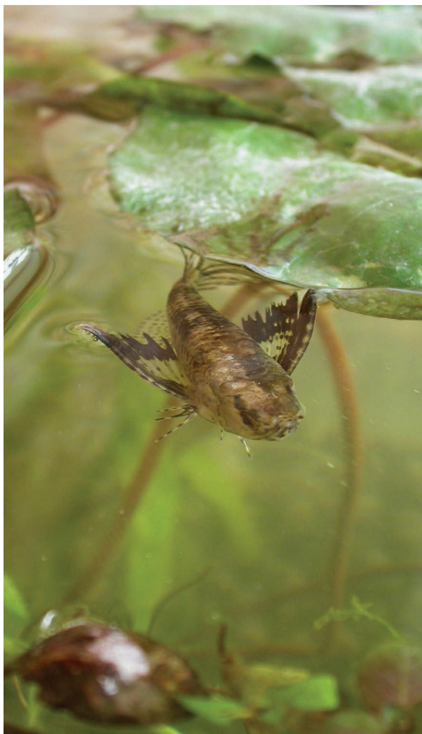
The freshwater butterflyfish, Pantodon buchholzi (LC), a widespread species in Africa, reaches the most westerly point of its range in Lokoli forest, Benin. This species is capable of jumping out of the water to search for insects or to escape from predators. It is not a glider, but a ballistic jumper, with tremendous jumping power.

distributions, they may be of high importance for maintaining genetic variability within a species and in ongoing evolutionary processes. Therefore, despite their small size, forest fragments deserve greater focus within conservation plans; their inclusion will help to ensure preservation of biodiversity in all its forms.