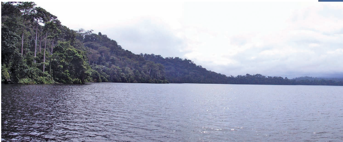
Lake Barombi Mbo, Cameroon. This lake is considered to be the oldest radiocarbon-dated crater lake in Africa.

worldwide, most commonly from North America, Europe and Australia. Their occasional occurrence in Africa is therefore of considerable scientific interest. It is postulated that multiple terrestrial impacts, particularly large ones, are of importance in both geological and biological terms and are likely associated with periodic species extinction events on land and in the marine environment occurring since at least the Cretaceous period (around 60 million years ago). The nature, persistence and effects of impact depressions depend on the 'target' substrate, the velocity of the impactor, its composition and identifying 'signature' – the physical and chemical outputs, such as meteorite shards, shock metamorphism, 'rock melt' and silica rich glasses. All of this may become biotically significant at some later stage of lake evolution. Other factors determining nature and persistence include the location, scale and form of the depression, and subsequent chemical, geological, geographical and biological processes including any underlying volcanic activity, erosion, deposition of sediments and ecological colonisation.