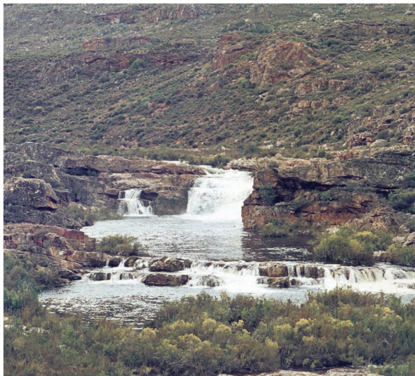
The Twee River in the Cedarburg Mountains, the Western Cape, South Africa.

When first discovered, the species was common and widespread in the tributary system – with larger adults occupying open water habitats in pools and runs, and juveniles shoaling along marginal zones. Since the 1970s, the population has declined markedly and is absent from large sections of its former range. The reasons for this decline are several, including