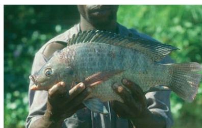
The Nile tilapia, Oreochromis niloticus, (LC), a highly favoured species for aquaculture.

Eastern Africa is endowed with six sub-species of Nile tilapia: O. niloticus niloticus (Linnaeus, 1758), originally from the White Nile Basin but now widely introduced elsewhere; O. niloticus eduardianus (Boulenger, 1912) in Lakes Edward, Kivu, Albert and George; O. niloticus vulcani (Trewavas, 1933) in Lake Turkana; O. niloticus sugutae Trewavas, 1983 in the Suguta