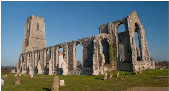
St Andrews Church in Covehithe