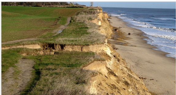
Covehithe Cliffs and Beach

Fun fact: The beach at Covehithe was the location of choice for a scene in an 1999 ITV adaptation of David Copperfield. This followed in the footsteps of the Monty Python crew who filmed a sketch called ‘The First Man to Jump the Channel ‘ at the same beach in 1969.