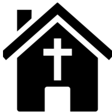
St Andrews Church Church & Heritage