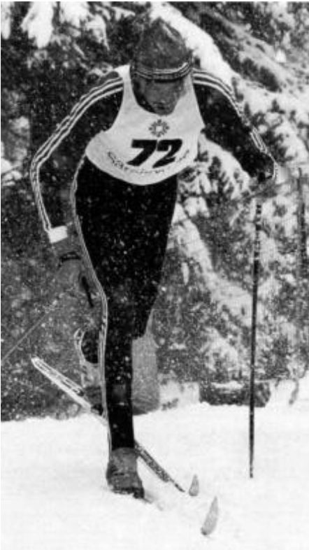
Nikolay Zimiatov (URS)