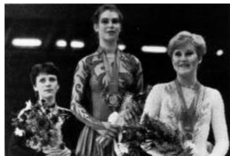
Katarina Witt (GDR) with Kira Ivanova (URS) on the left and Rosalyn Summer (USA).