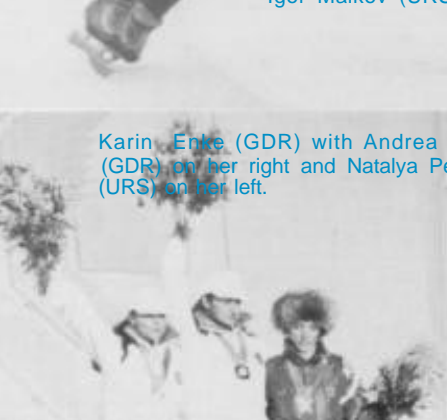
Karin Enke (GDR) with Andrea Schoene (GDR) on her right and Natalya Petrousseva (URS) on her left.