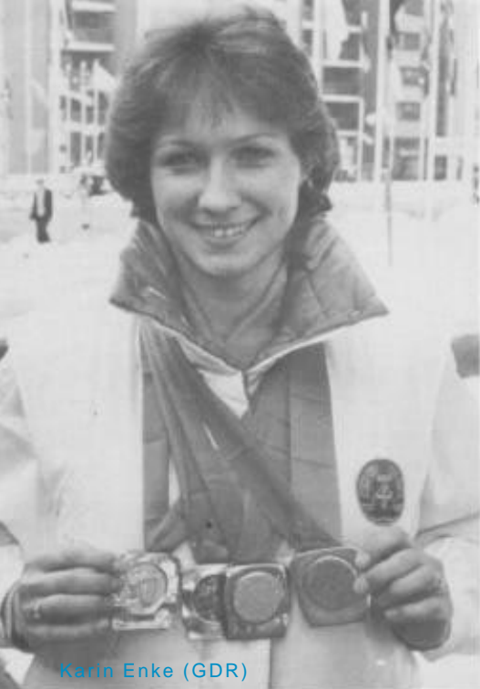
Karin Enke (GDR)