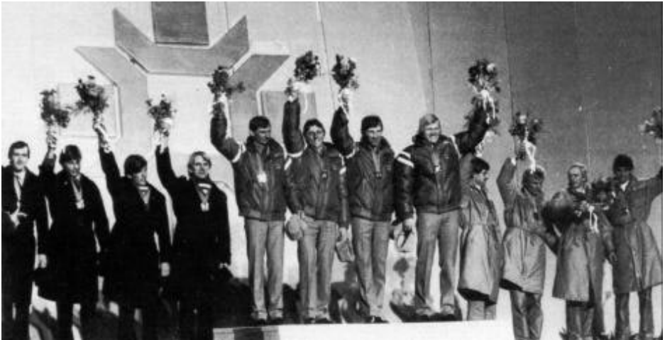
The Olympic 4 x 7,5 relay champions