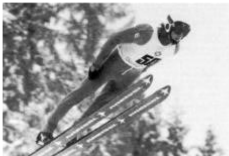
Jens Weissflog (GDR).