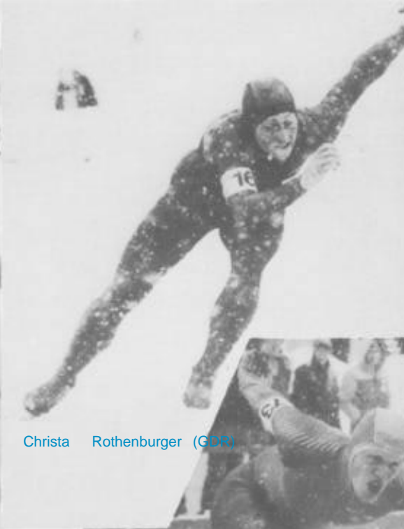
Christa Rothenburger (GDR)