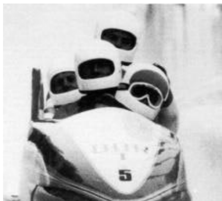
The victorious Olympic four men bob team