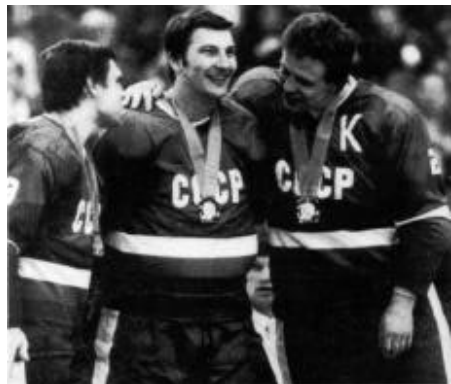
W. Tretjak with V. Krutov ont he left and V. Fetissov.