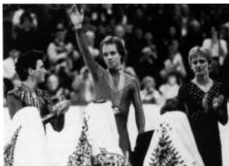
Scott Hamilton (USA) with Bran Orser (CAN) on his right and Jozef Sabovtchik on his left (TCH)