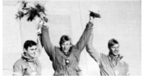
From left to right Aki Karvonen (FIN), Gunde Anders Swan (SWE) and Harro Kirvesniemi (FIN)