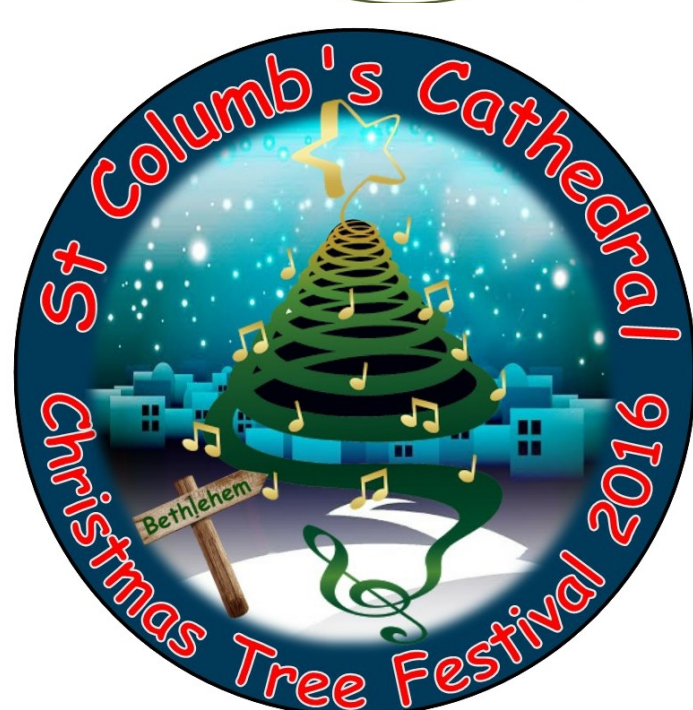
Details in separate flyer!

The Dean Invites The Church Wardens, Select Vestry and Parishioners to his Installation On Saturday 24<sup>th</sup> September, 2016 at 3 o'clock